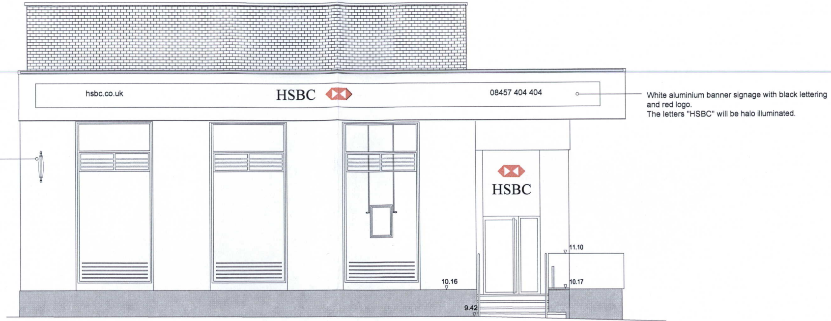
SOUTH ELEVATION - HIGH STREET

DEVELOPMENT CONTROL SECTION 23 JAN 2006 DATE RECEIVED