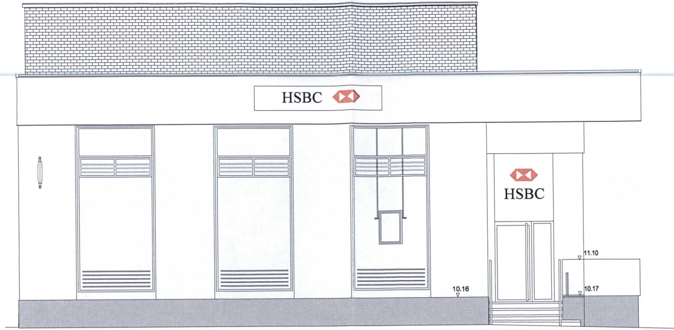
SOUTH ELEVATION - HIGH STREET

DEVELOPMENT CONTROL SECTION 23 JAN 2006 RECEIVED