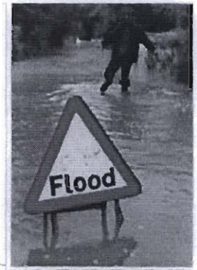
Flooding: be prepared