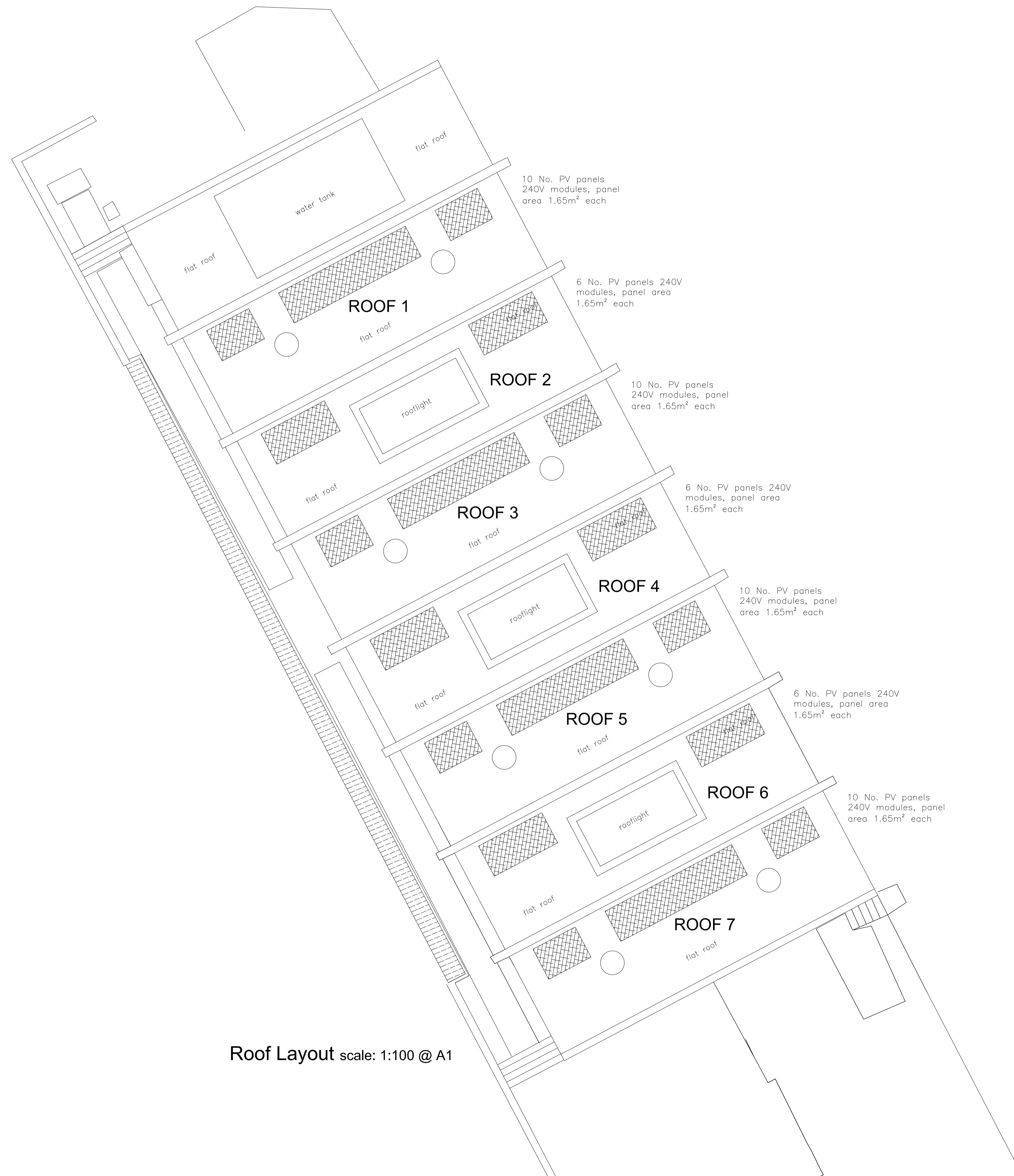
Roof Layout scale: 1:100 @ A1