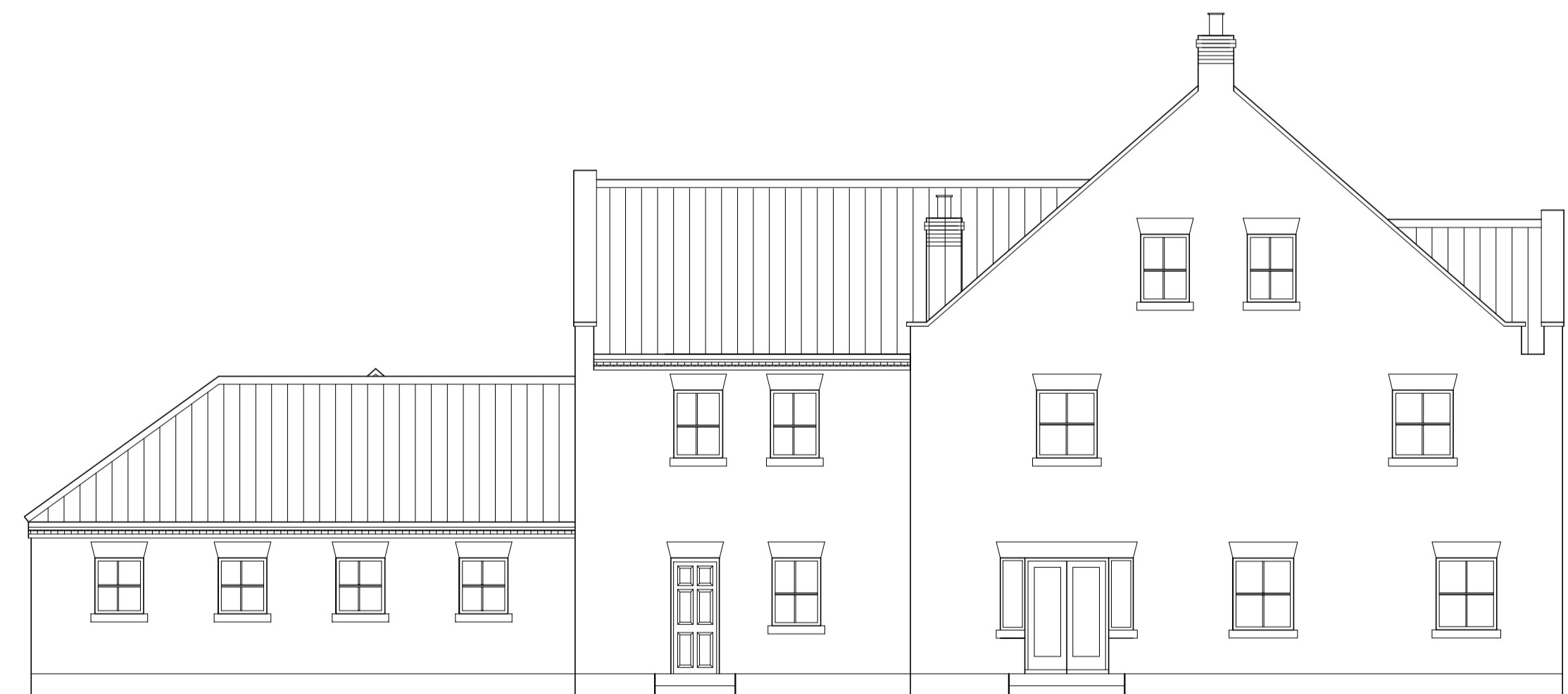
Left Side (west) Elevation