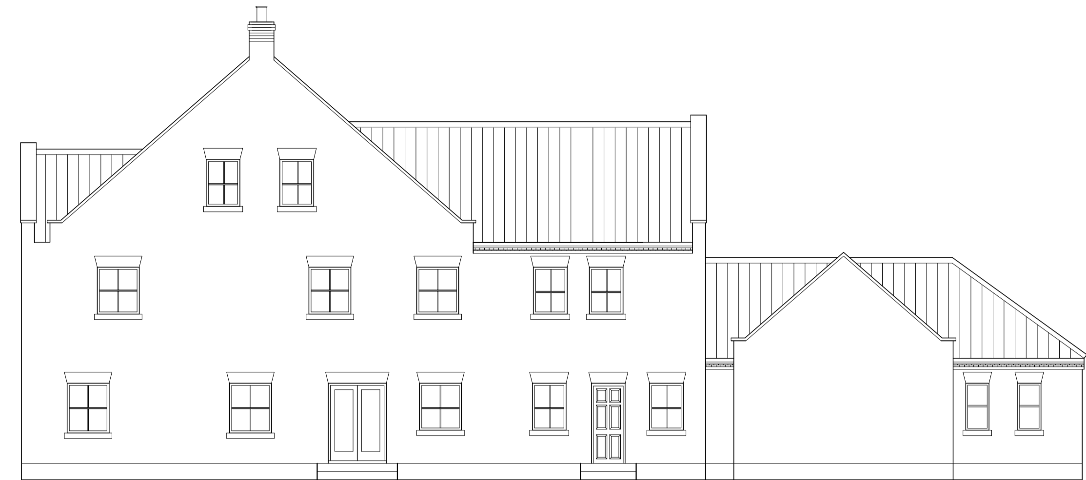
Right Side (east) Elevation