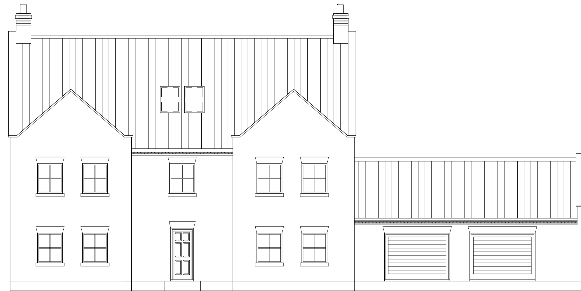
Front (south) Elevation