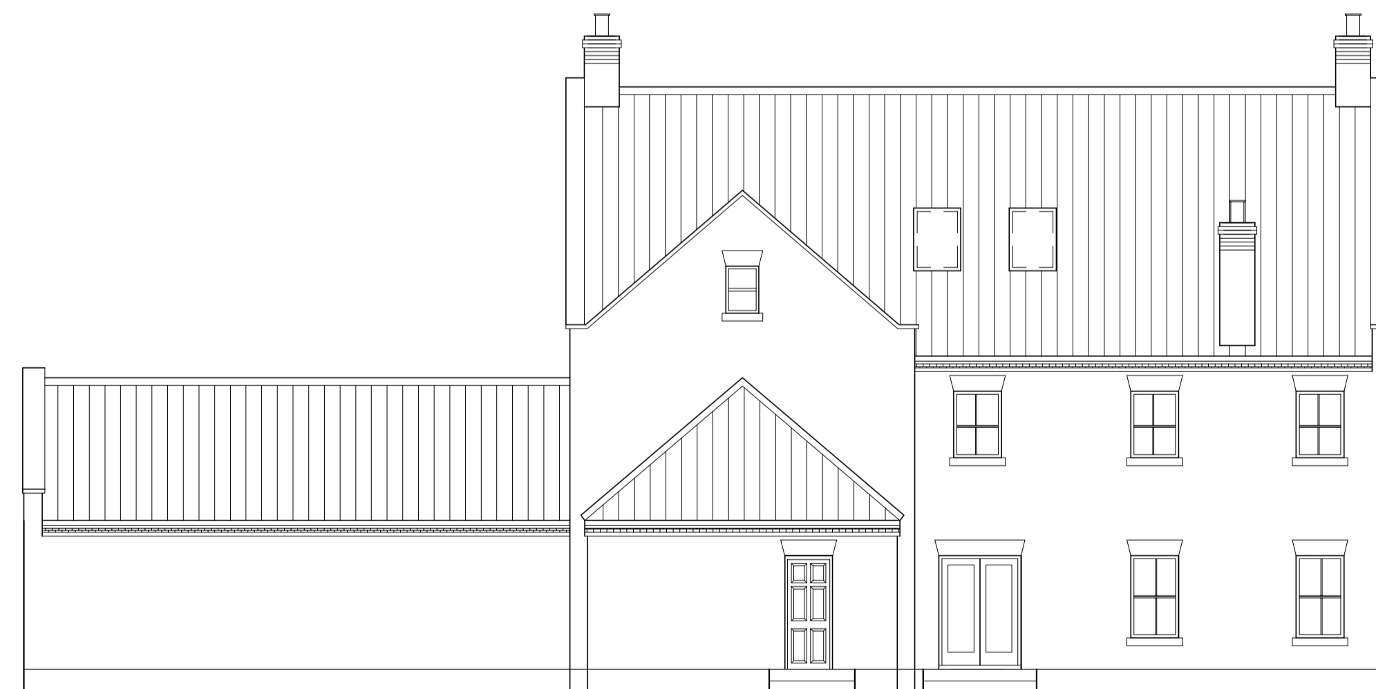
Rear (north) Elevation