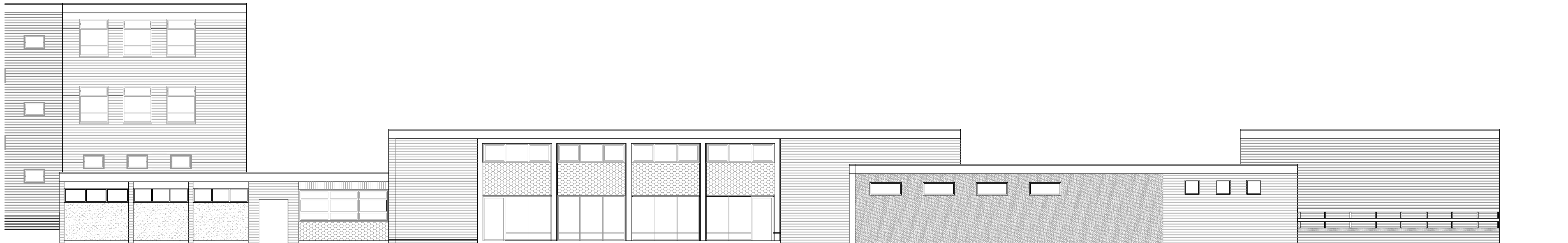
▲ ELEVATION C