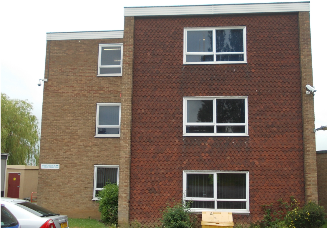
Previously Installed Upvc Window frames on Elevation