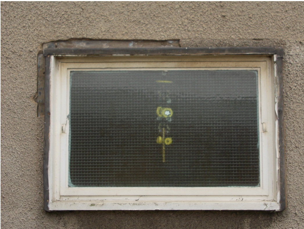
Degradation of existing window surround