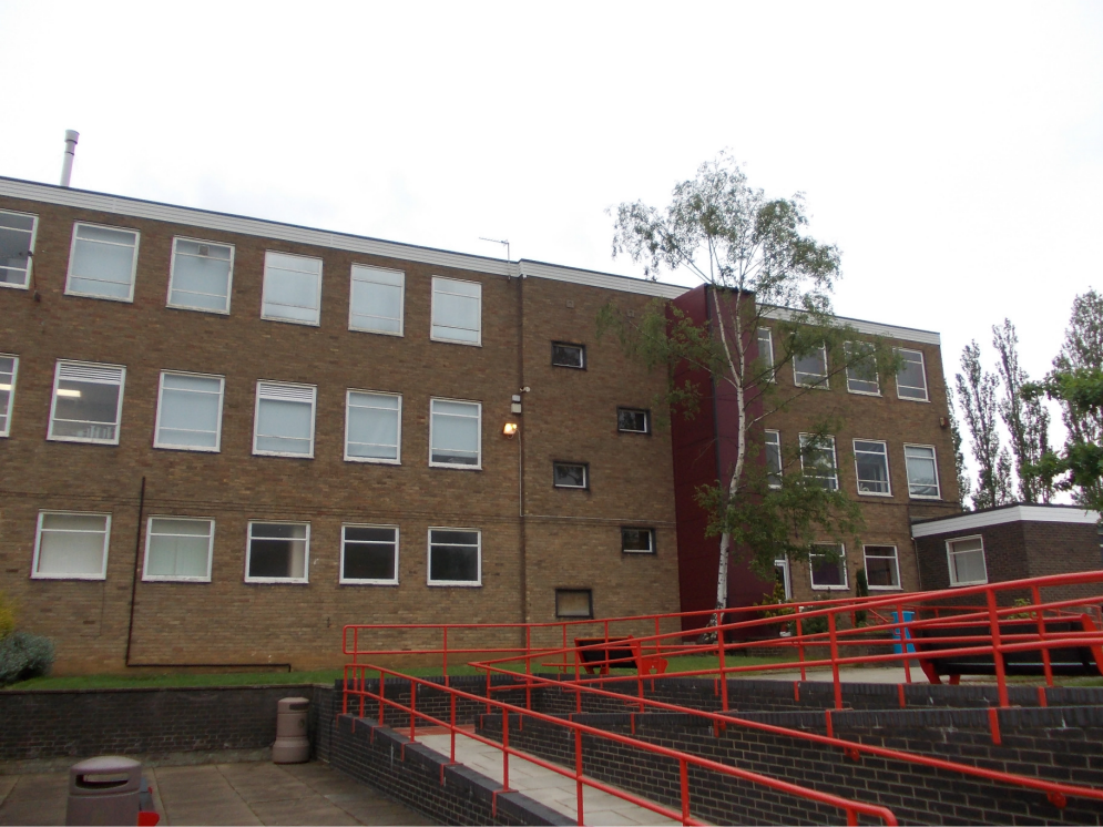
Existing Elevation Requiring Window Replacement