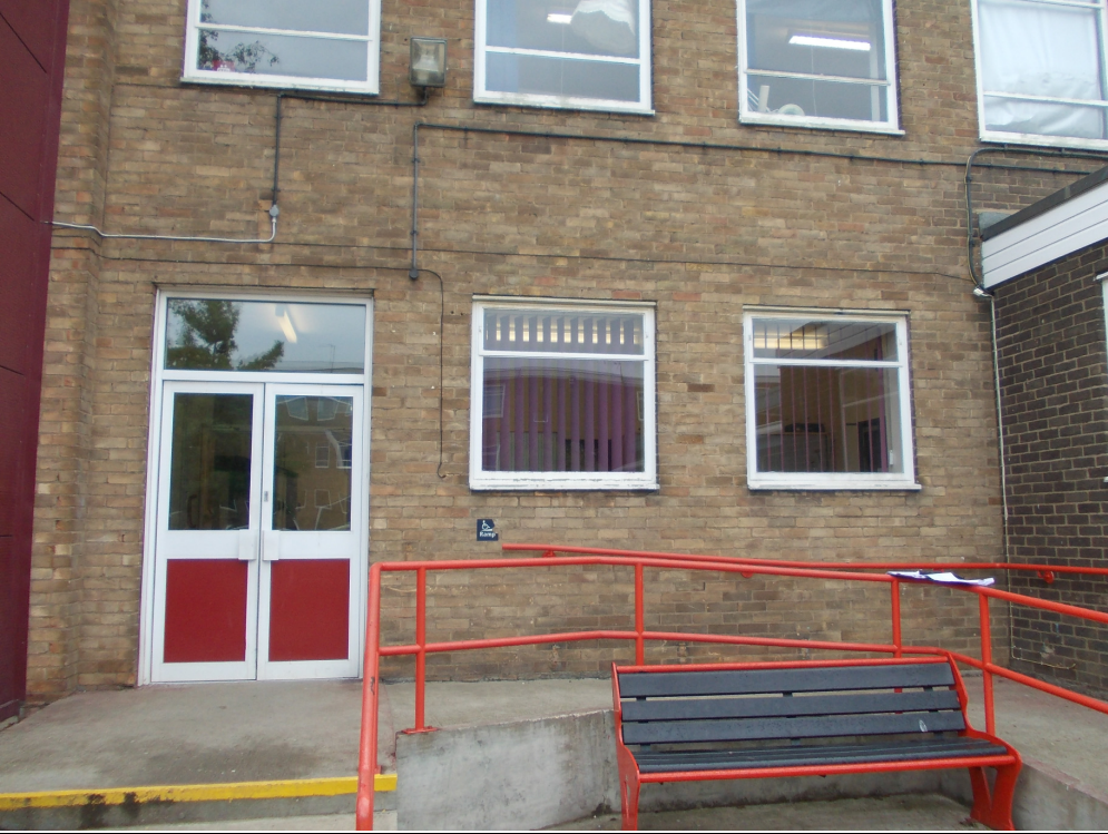
Existing Elevation Showing Existing Aluminium Door Frame