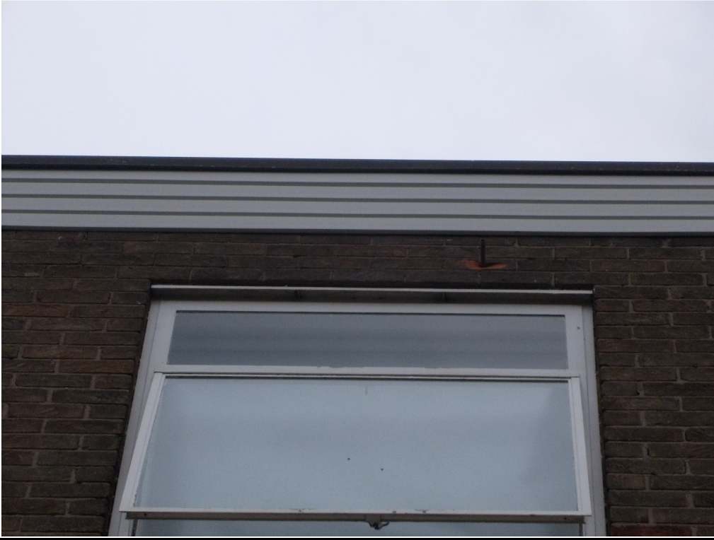
Existing Upvc Fascia boarding to roof perimeter