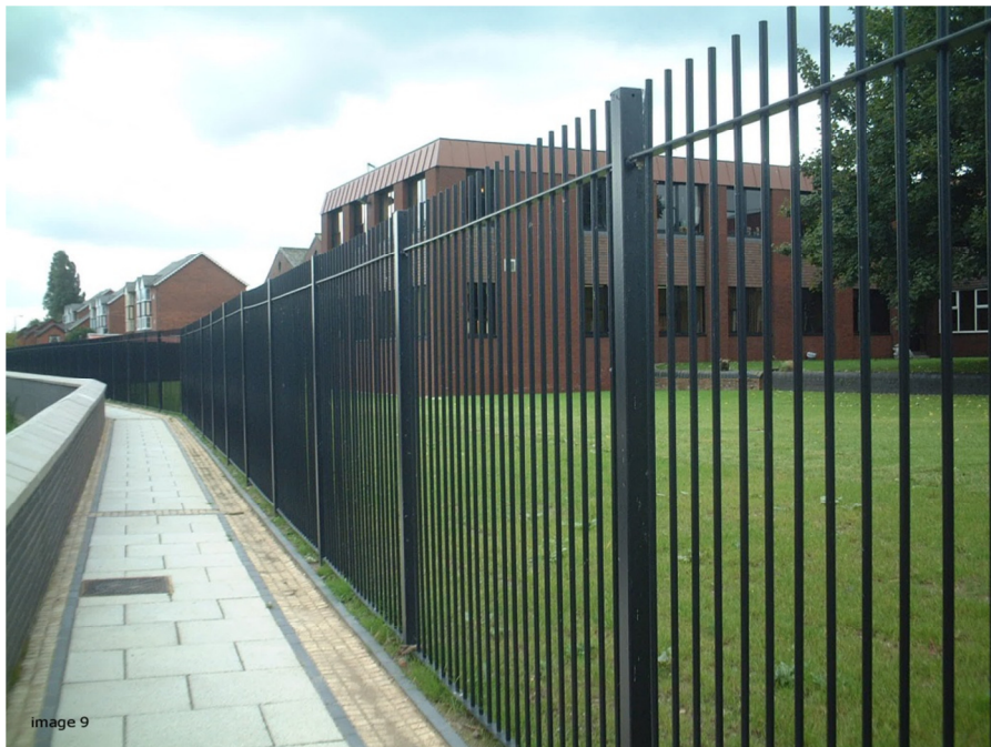
Vertical bar railing