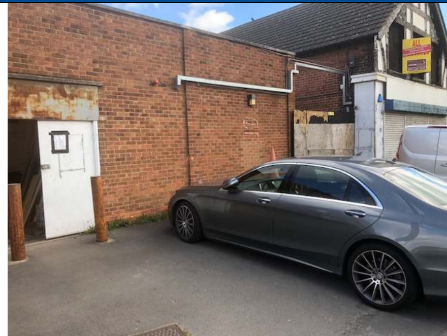
PARKING FOR VEHICLE AND SKIP