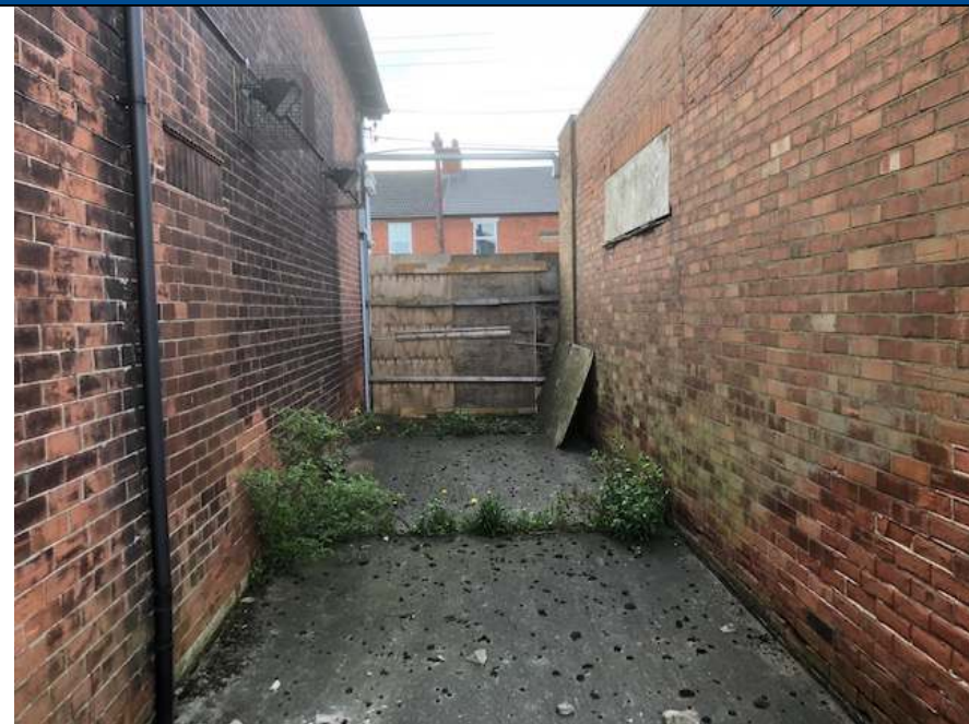
POSITION OF HYGIENE UNIT