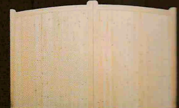
Bow Top Gate