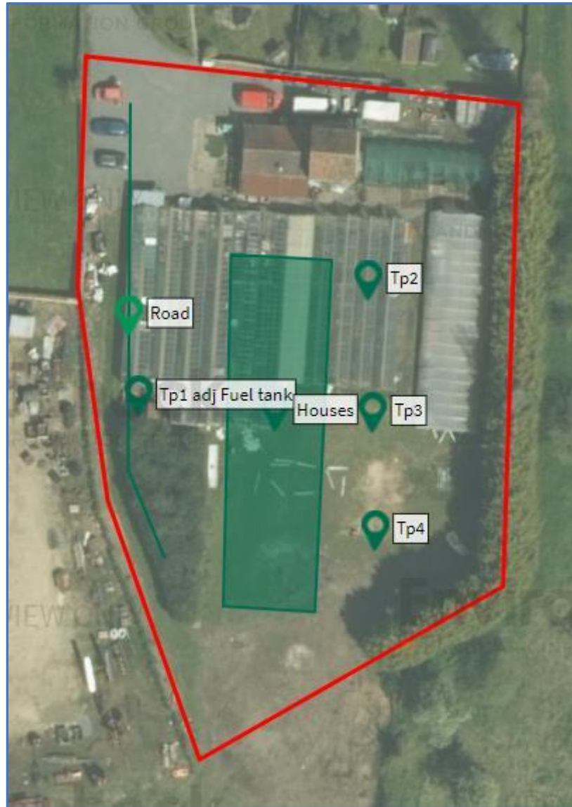
Schematic overview of scheme