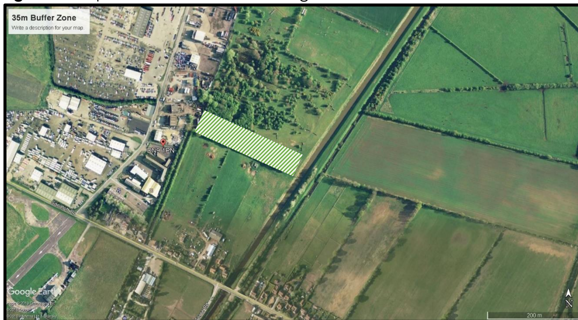
Figure 4: Proposed buffer zone for badger.

3.1.9 It should be noted that, due to the likely outlying transient nature of the sett along with the wider landscape being capable of supporting badger populations from within the same clan, a badger licence to interfere with setts for development purposes (A24) is likely to be obtainable.