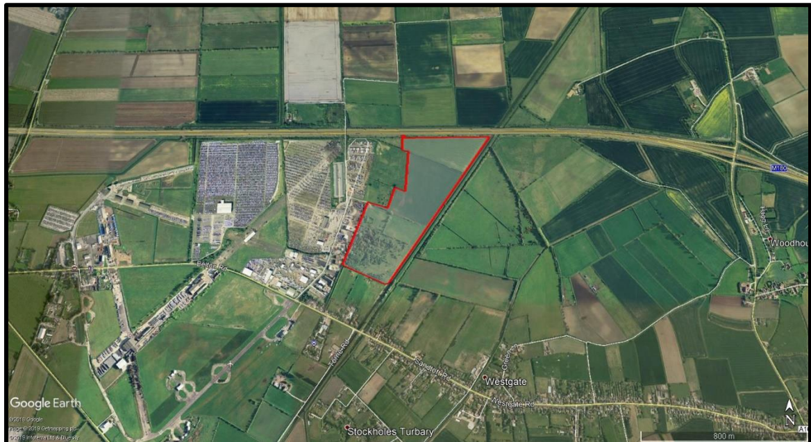
Figure 1: The site: Land East of Sandtoft Industrial Estate Road 1, Sandtoft Industrial Estate, Belton, North Lincolnshire.