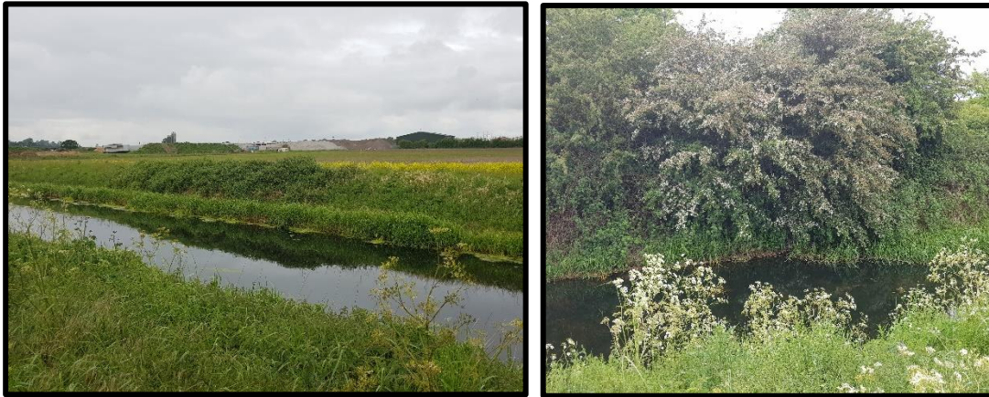
Figure 3: The River Torne and Hatfield Chase Ditches.