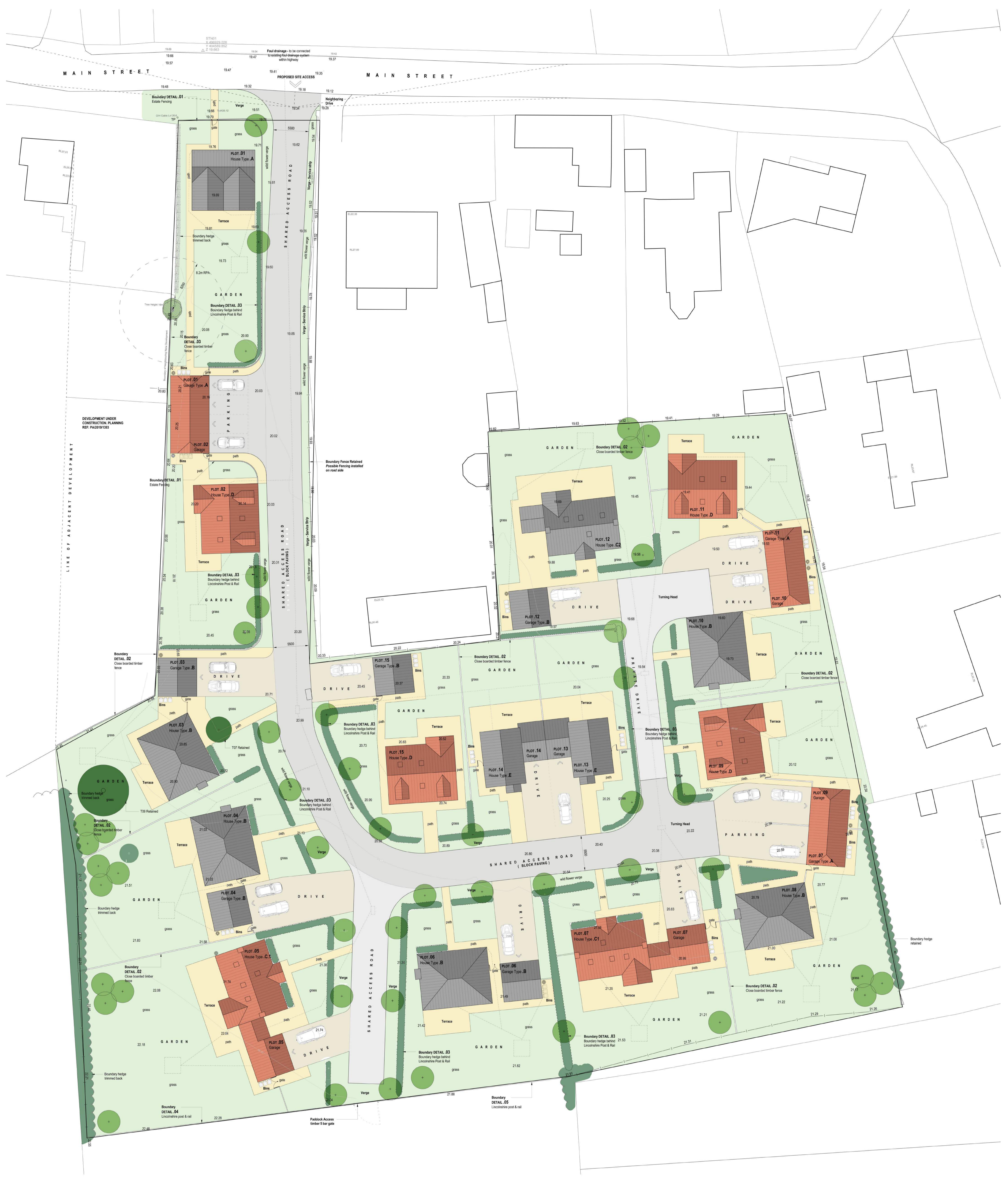
PROPOSED SITE PLAN Scale: 1:250