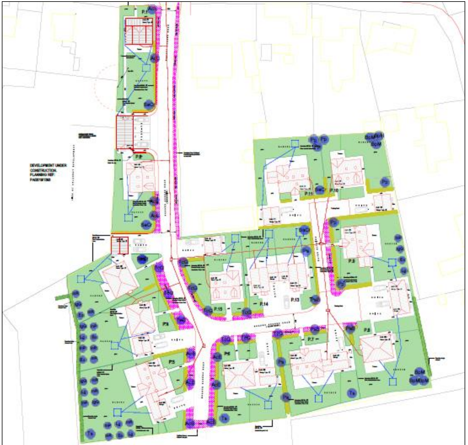
Image source: © 2022 EQUANS – Proposed Landscape Plan Dwg. LP_03_210722_AH Rev2