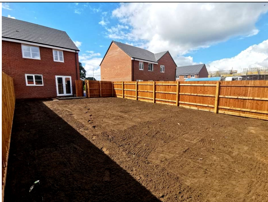
Overview of plot 13 (rear)