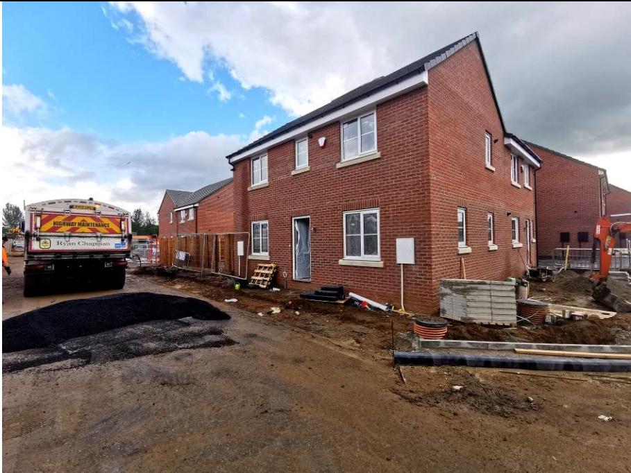
Overview of plot 11 (front)