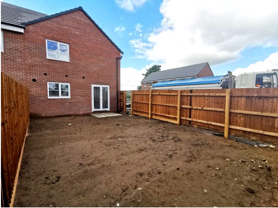
Overview of plot 11 (rear)