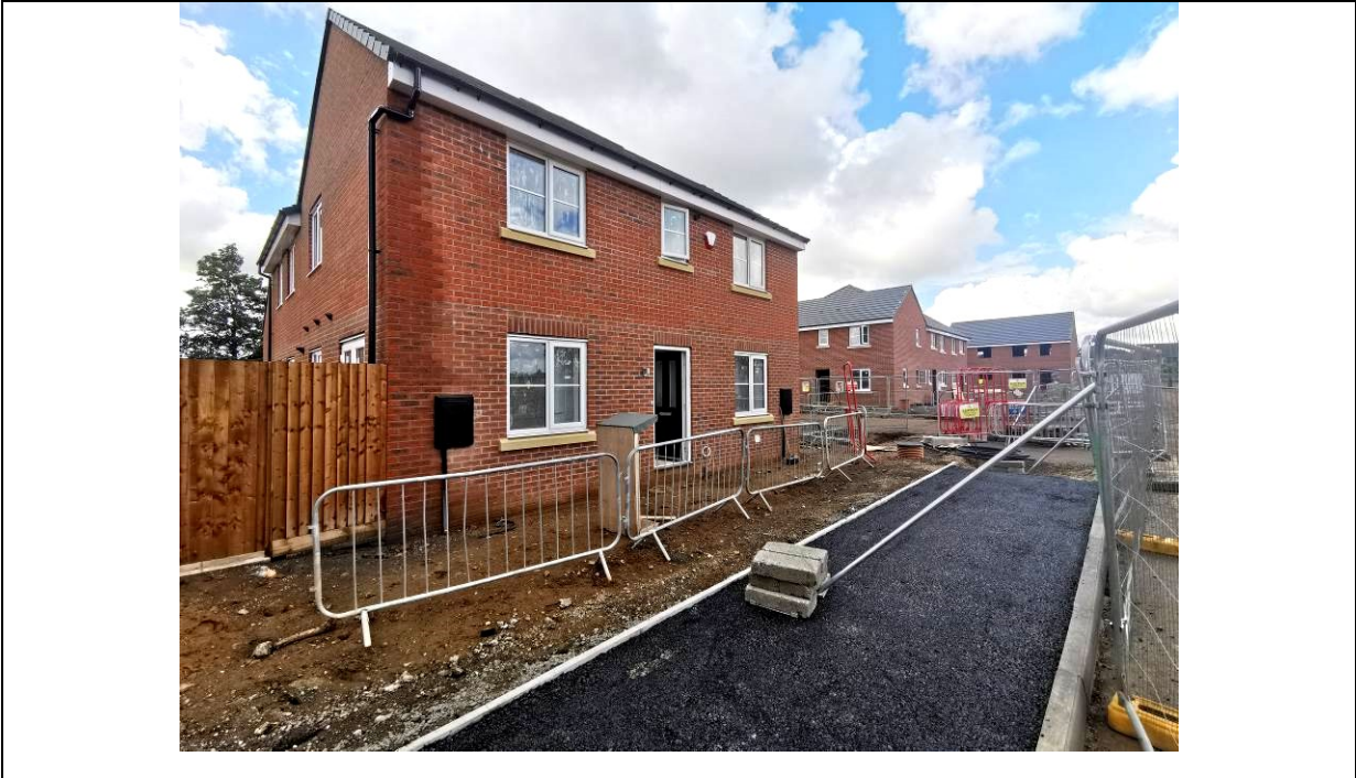
Overview of plot 9 (front)