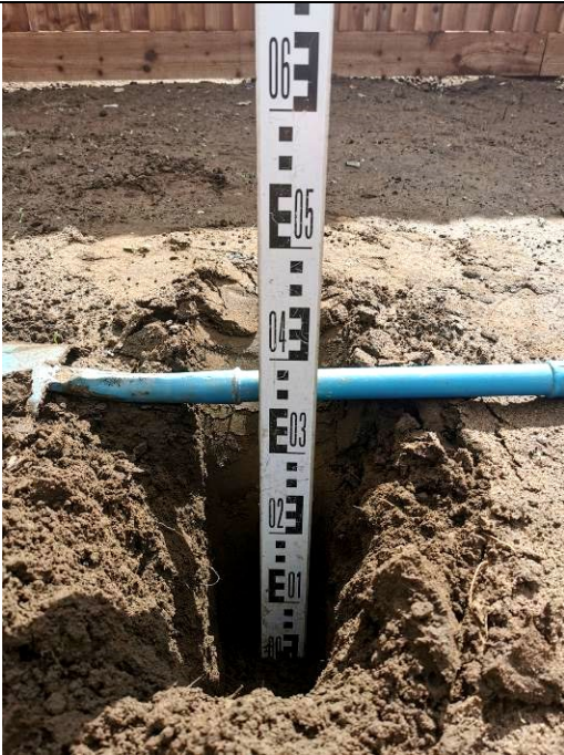
Verification pit – plot 12