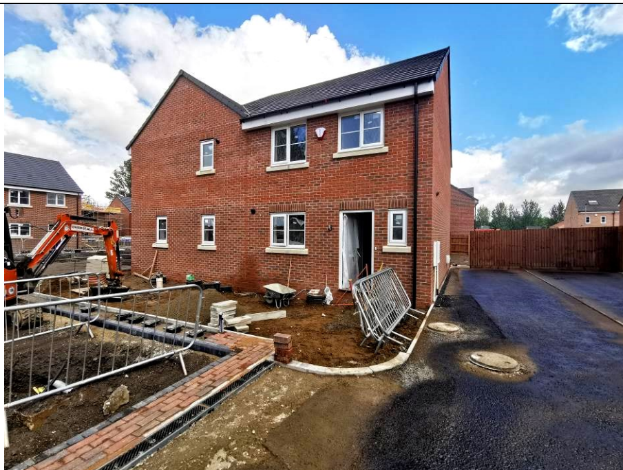
Overview of plot 12 (front)