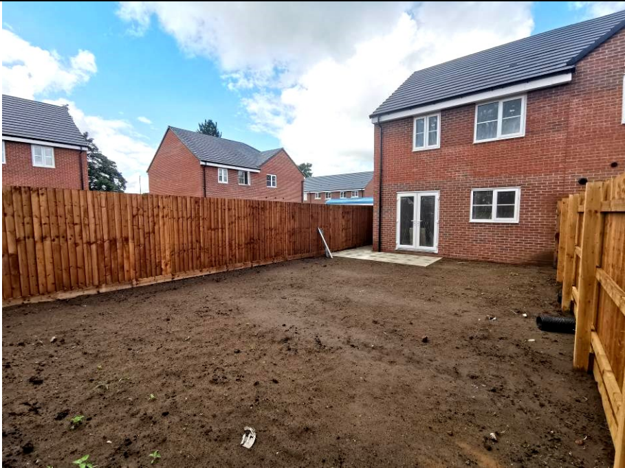
Overview of plot 10 (rear)