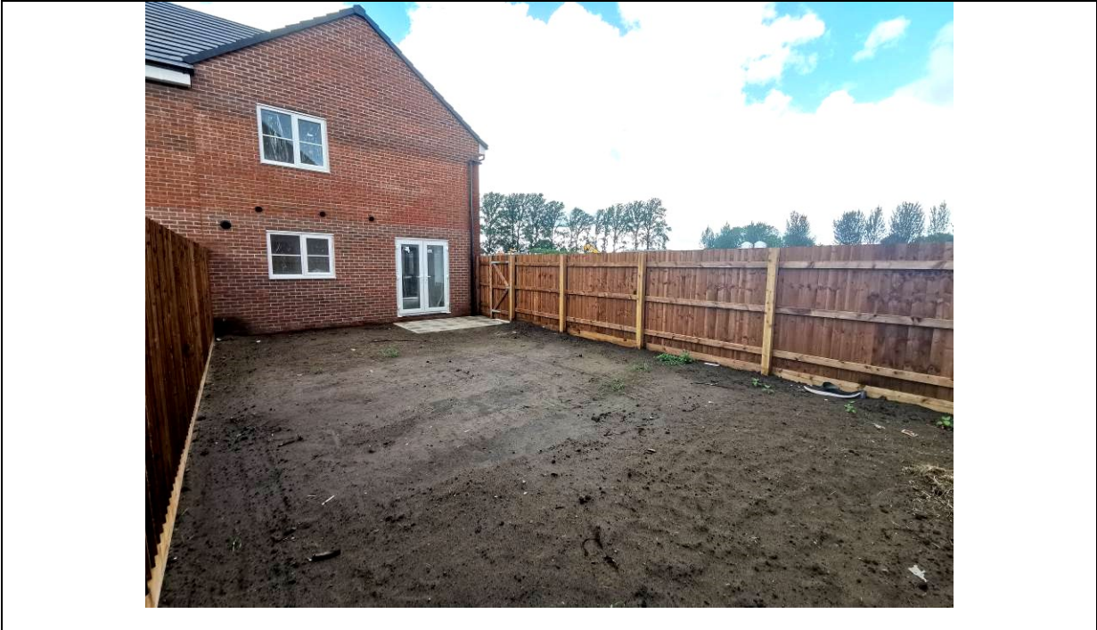
Overview of plot 9 (rear)