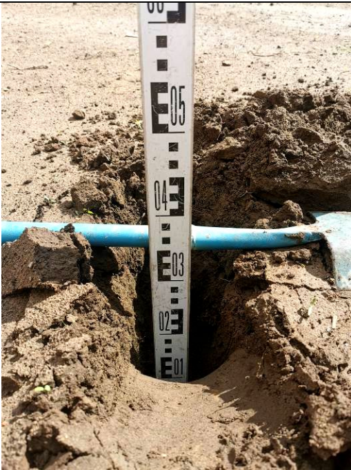
Verification pit – plot 10