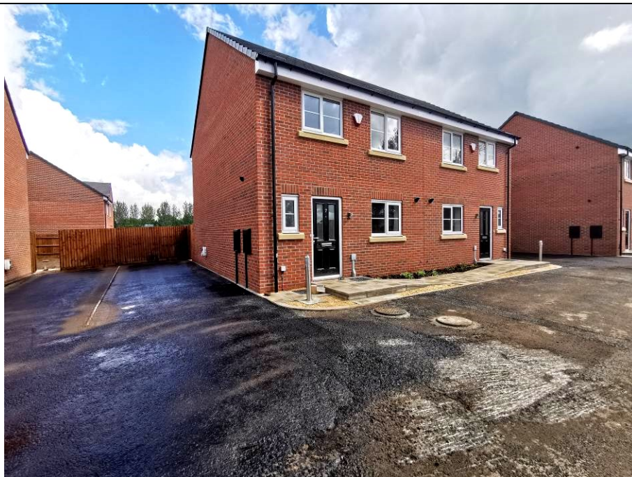
Overview of plot 13 (front)