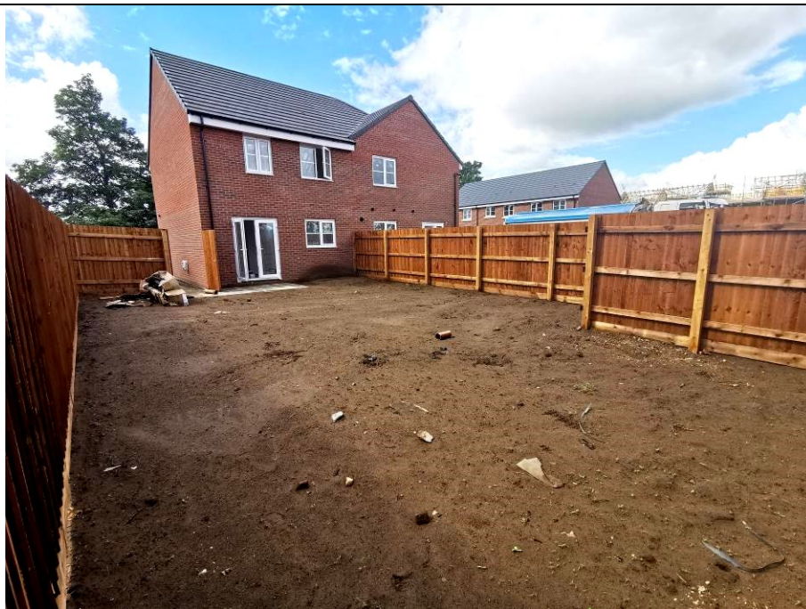
Overview of plot 12 (rear)