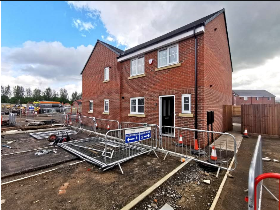
Overview of plot 10 (front)