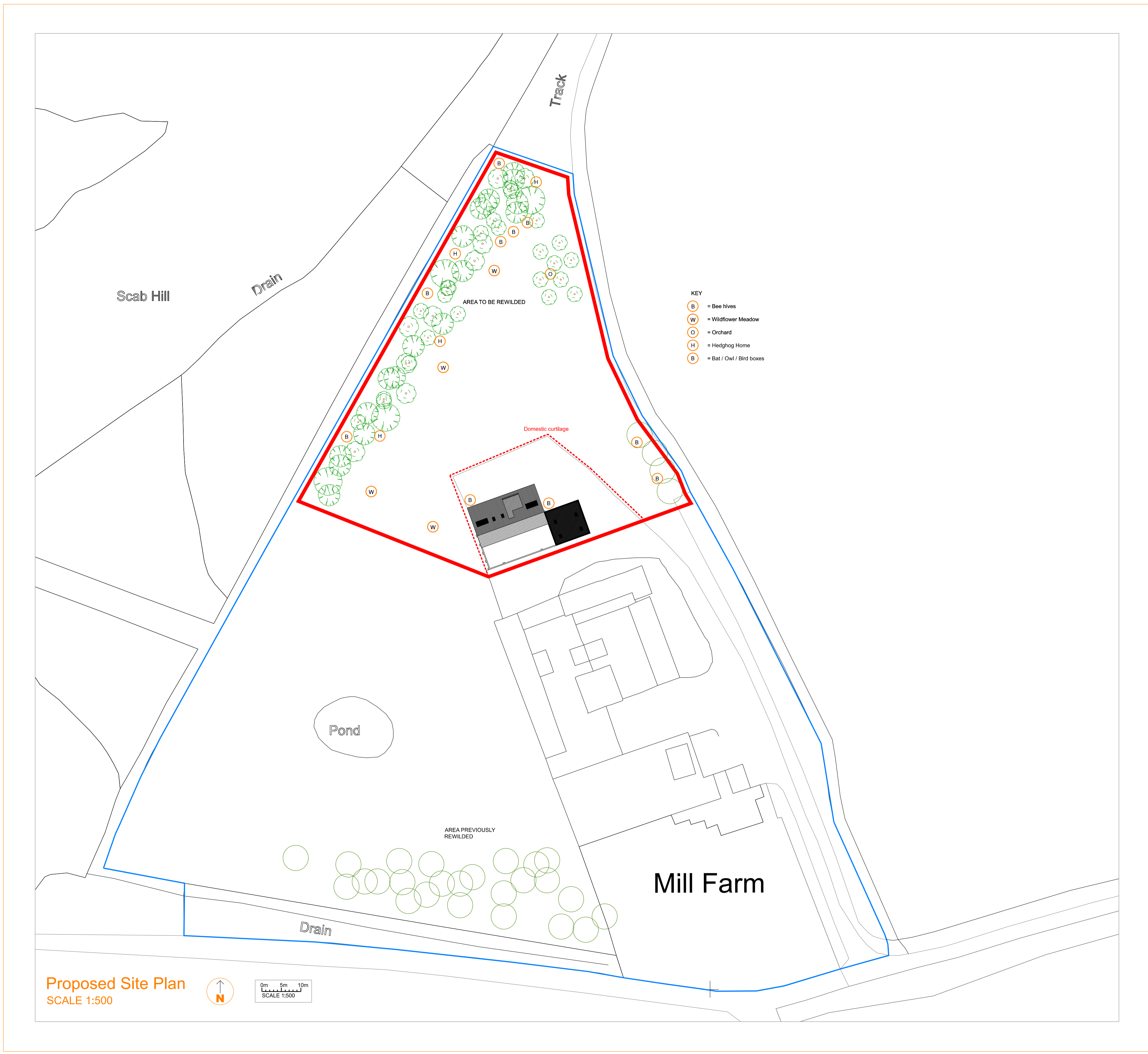
Proposed Site Plan SCALE 1:500