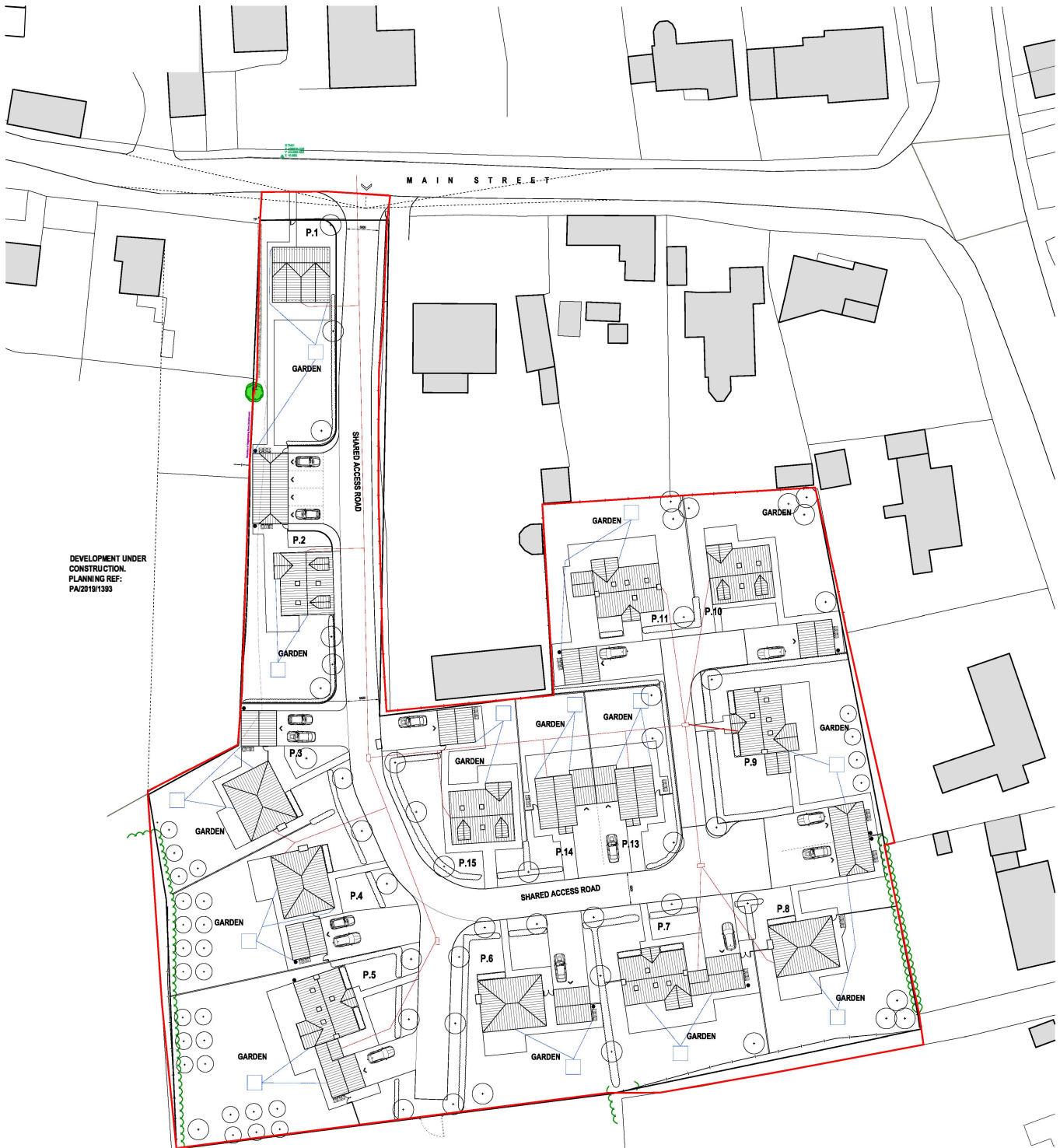
PROPOSED BLOCK PLAN Scale - 1:500