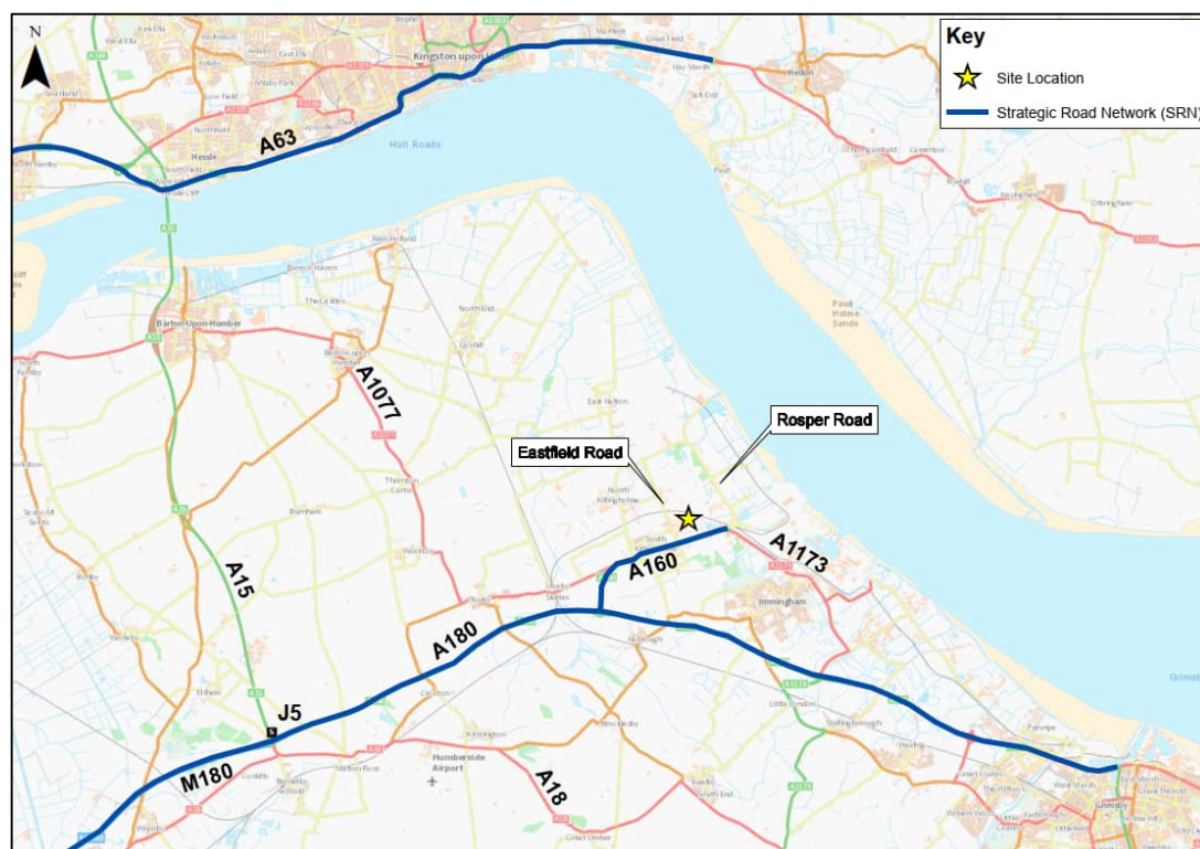
Plate 8.2: Local and strategic road network