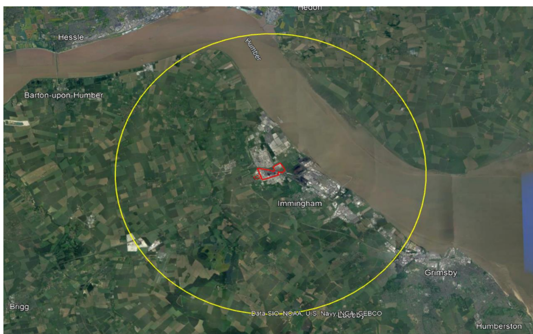
Figure 2.2 – Extent of Outer Consultation Zone

2.5.7 The extent of the OCZ is shown in Figure 2.2 .