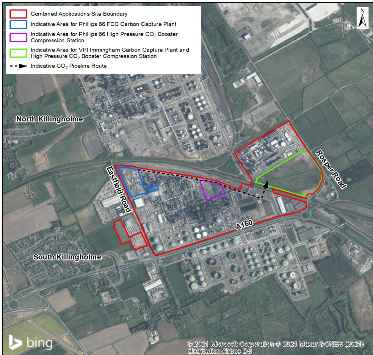
Figure 1.2 – Location of the Humber Zero Proposals