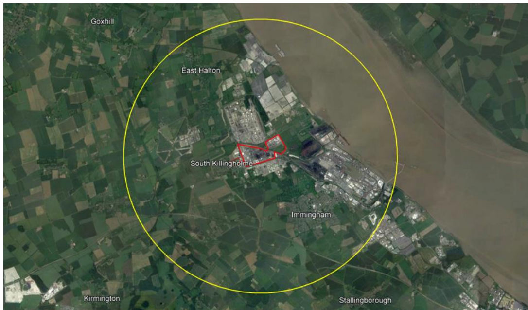
Figure 2.1 – Extent of Inner Consultation Zone

2.5.6 The OCZ has been defined by reference to the early EIA work being undertaken and extends to approximately 10 kilometres from the Humber Zero proposals. The OCZ is considered to broadly represent the maximum extent of the area within which environmental impacts, such as air quality and landscape and visual effects could occur. While we do not anticipate any significant adverse impacts within the OCZ there could be interest in the proposals from residents and business within this area. The newsletter will not be issued within the OCZ; however, notices will be placed within newspapers circulating within the OCZ to make people aware of the proposals and the consultation and a range of other methods will be employed to reach people within this area, including communications with local elected representatives and use of radio channels and online platforms.