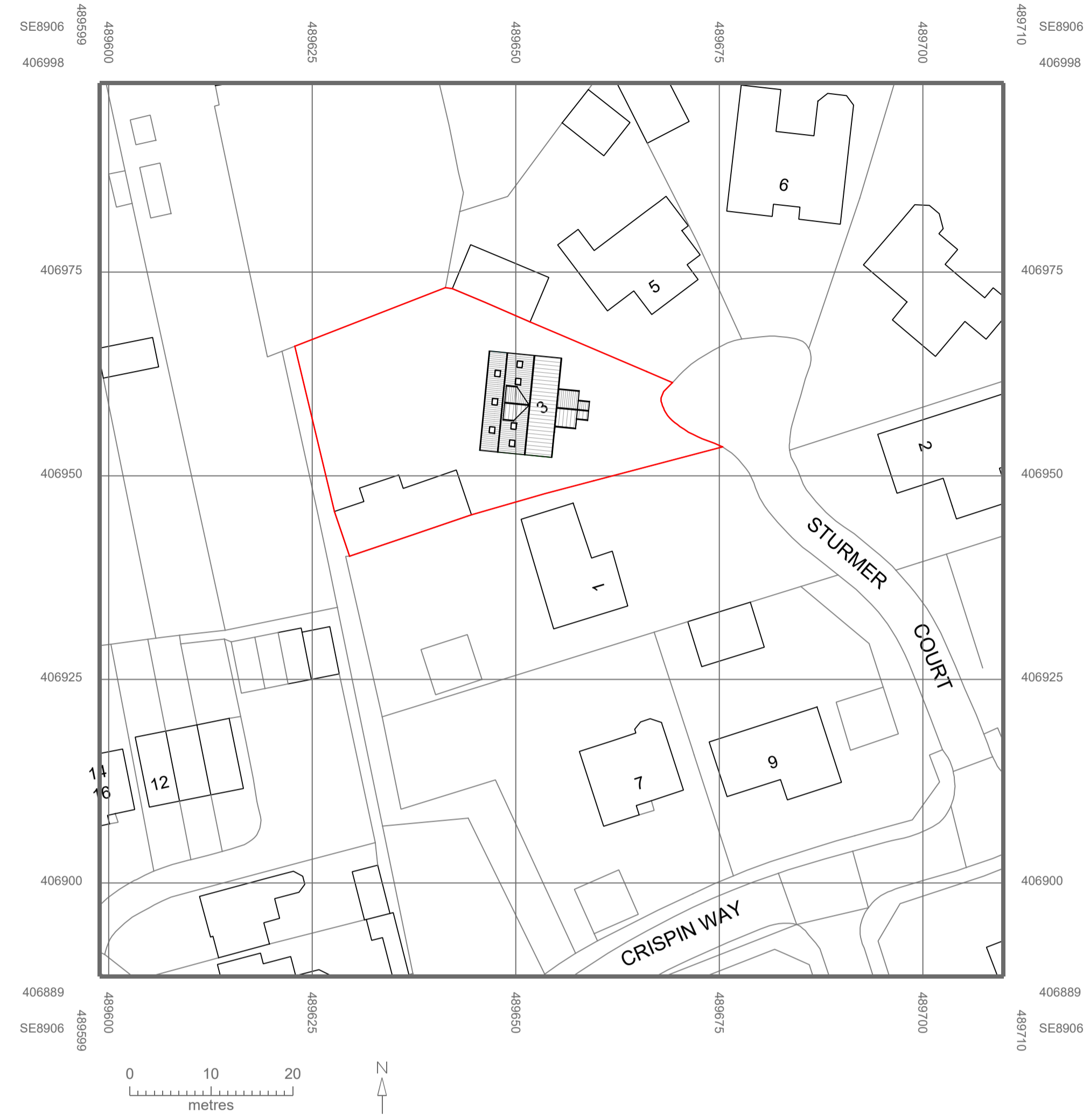
Proposed Site Plan @ 1:500