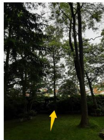
Tree, seen from the garden