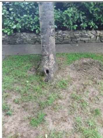
Cavity in the base to the south.

Tree: T002 Site: 286 Burrington Road Sycamore No action