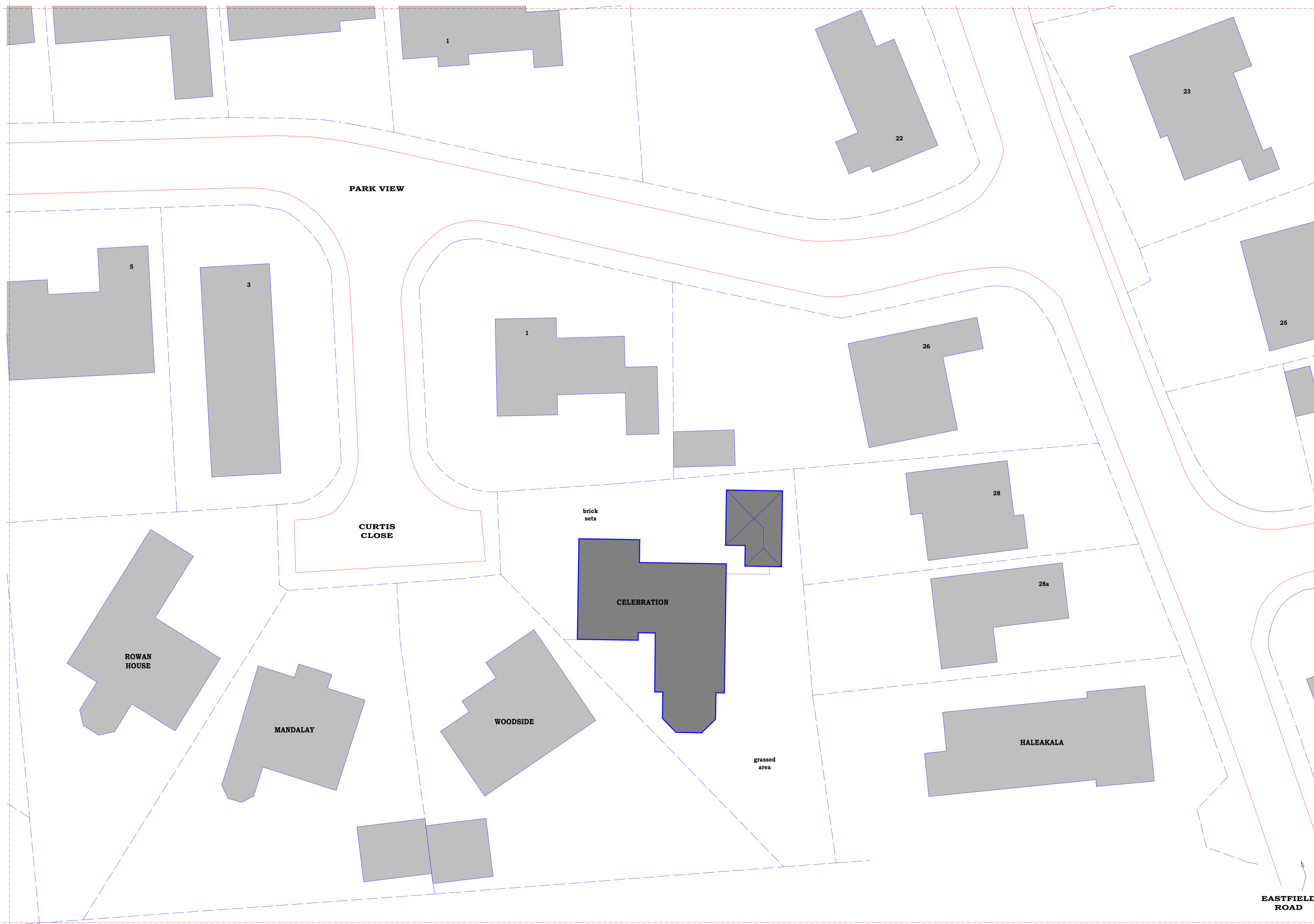
BLOCK PLAN SCALE - 1:200

NOTES All dimensions must be checked on site and not scaled from this drawing.