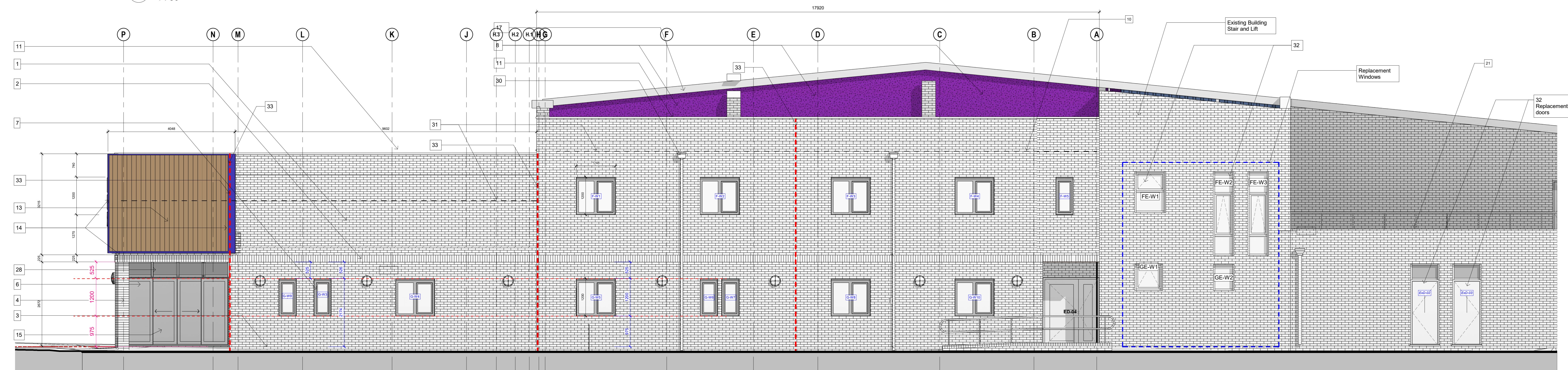
2 Proposed North - Callout 1 1 : 50

Notes: 1. Do not scale dimensions from this drawing. Only figured dimensions are to be taken from this drawing. 2. Check all dimensions on all orders concerning the work to be done. 3. The architect shall retain all dimensions to the original setting out. 4. If any drawing shows a variation to the original setting out, the designer is to be contacted before the work is started. 5. Work within the Construction (Design and Management) Regulations 2015 is to be carried out in a safe and sound manner. 6. Copyright: All rights reserved. This drawing must not be reproduced without permission of North Lincolnshire Council. 7. Based upon the Ordnance Survey mapping with permission of the Controller of Her Majesty's Stationery Office & Crown Copyright. 8. Unauthorised reproduction infringes Crown Copyright and may lead to prosecution or civil proceedings. 9. North Lincolnshire Council 100012349 2016