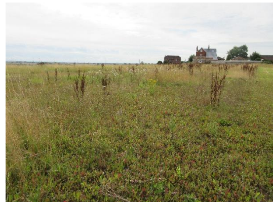
Photograph 2: Further view of the arable field

The baseline biodiversity unit (BU) value of the site is 10.8 for the area habitats, with the detailed results shown in Table 2 below.