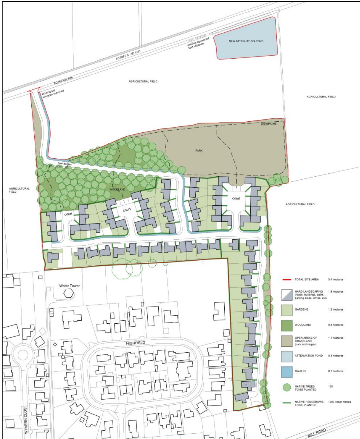
Figure 2: Proposed site plan (taken from Soft Landscaping Plan, Drawing Number 607.12, Kelly & MacPherson Architects, September 2023)