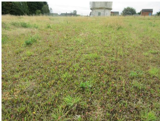
Photograph 1: Arable c1c7 on site

The total area of the site is 5.4ha, with all of it comprising part of a large arable field (classed as c1c7 - other cereal crops within UKHabs). Although the site was fallow at the time and had a mixed sward, it is classed as cropland in UKHabs (2023) if it has been cropped or cultivated within the current or previous year, and the site was last cropped in 2022 (pers. comm. with agent). It is not possible to allocate a condition score to this habitat type.