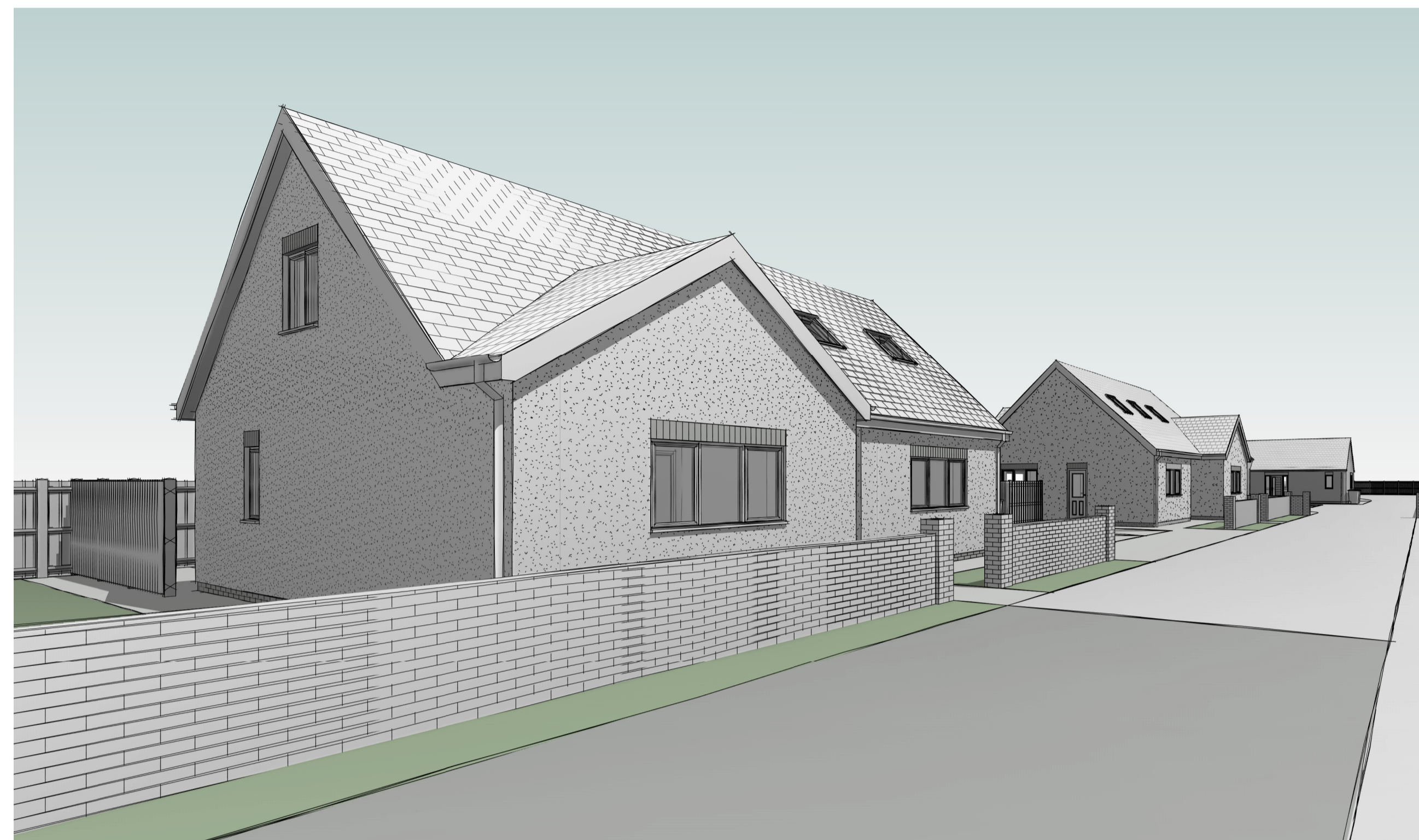
3D - Site Entrance

Notes Explanations: Unless otherwise stated - • All dimensions are in millimeters • Dimensions are shown from structure, NOT finishes Instructions: Responsibility is not accepted for values obtained in scaling from this drawing. Construction information should be taken from written dimensions only. Inconsistencies should be reported to the Author immediately. References: To be read in conjunction with: