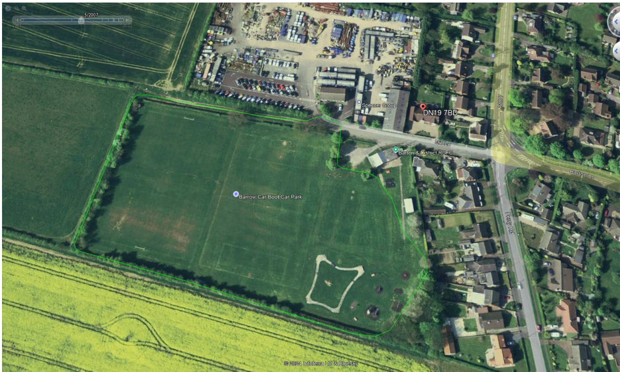
2007 Google aerial image showing an adult pitch and rugby union pitch

places power database the playing field is used for adult football, senior rugby union and mini soccer 7v7. However, the database does not provide any details where these pitches are marked out on the playing field. When reviewing the site plans and aerial imagery it appears that the container would be sited in an area of playing field that has been marked out for rugby union and football activity.