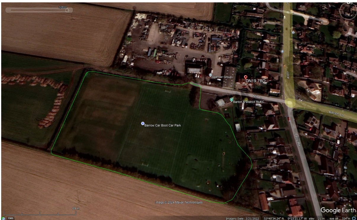
2022 Google aerial image showing rugby union pitch and football goal post.