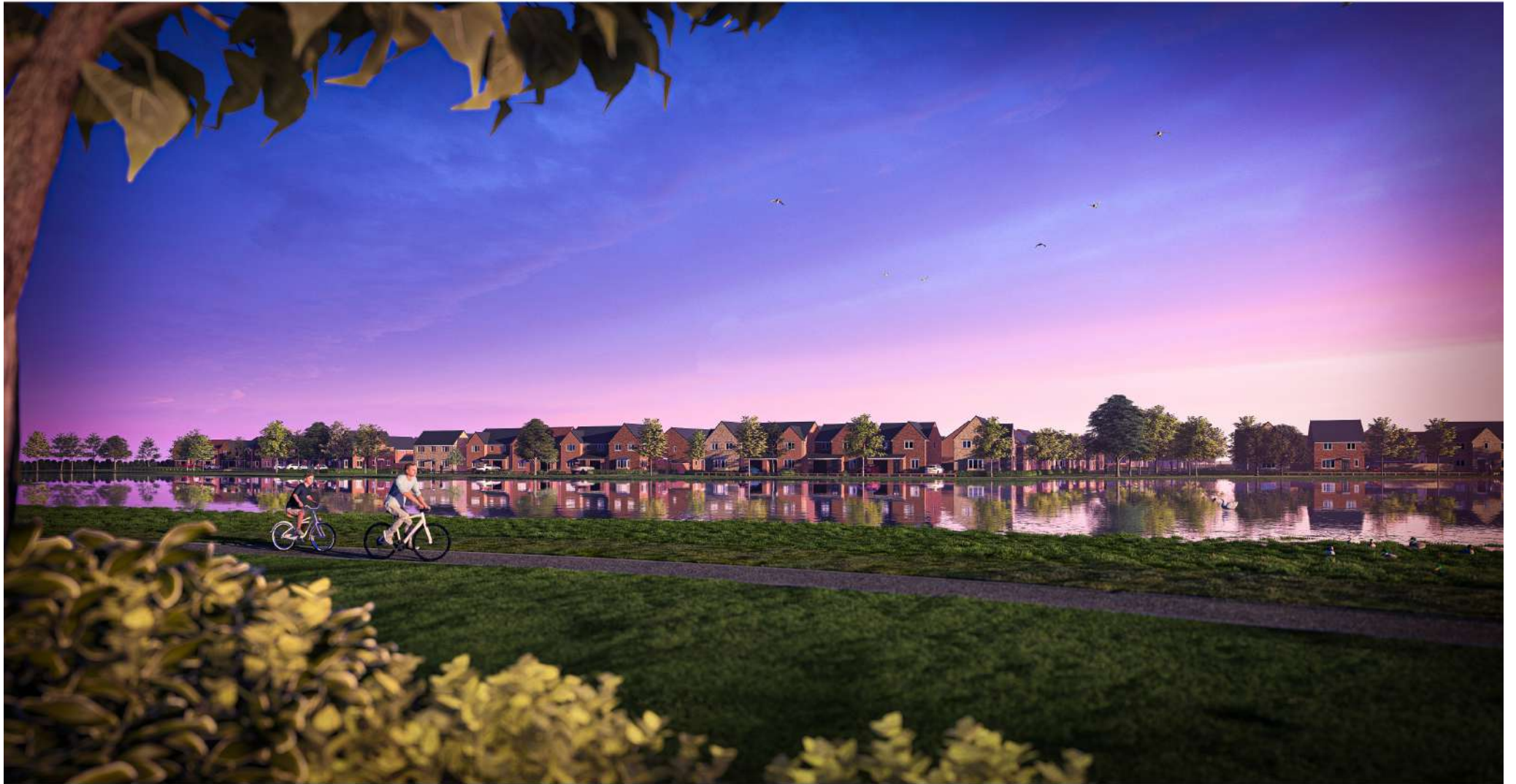
View 3 - Sunset