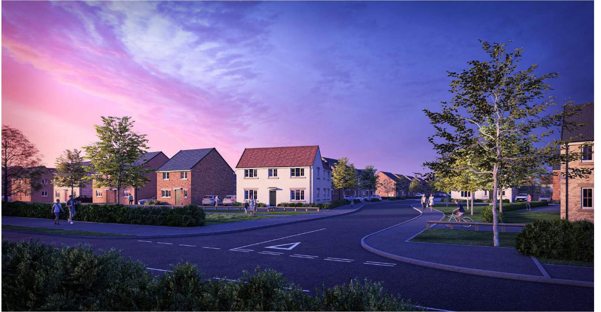
View 1 - Sunset