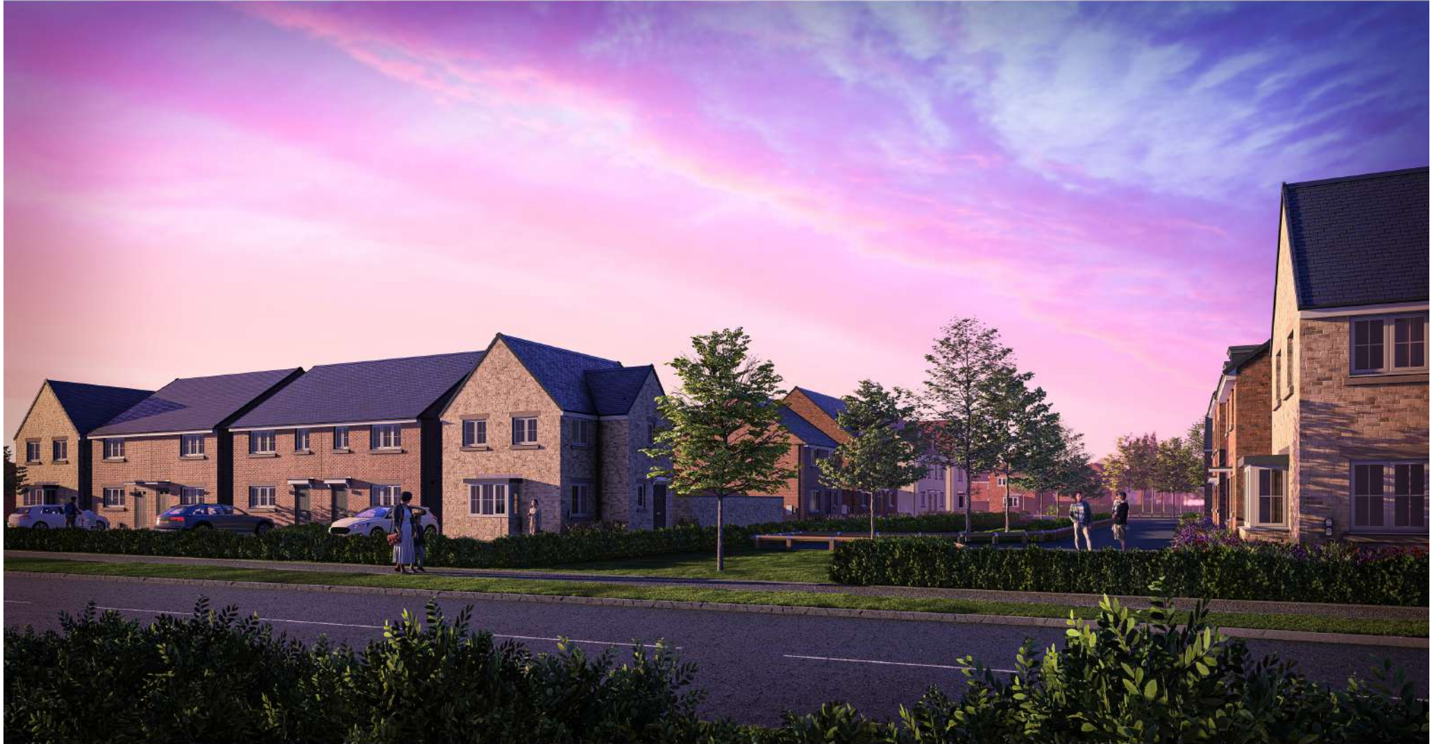
View 4 - Sunset