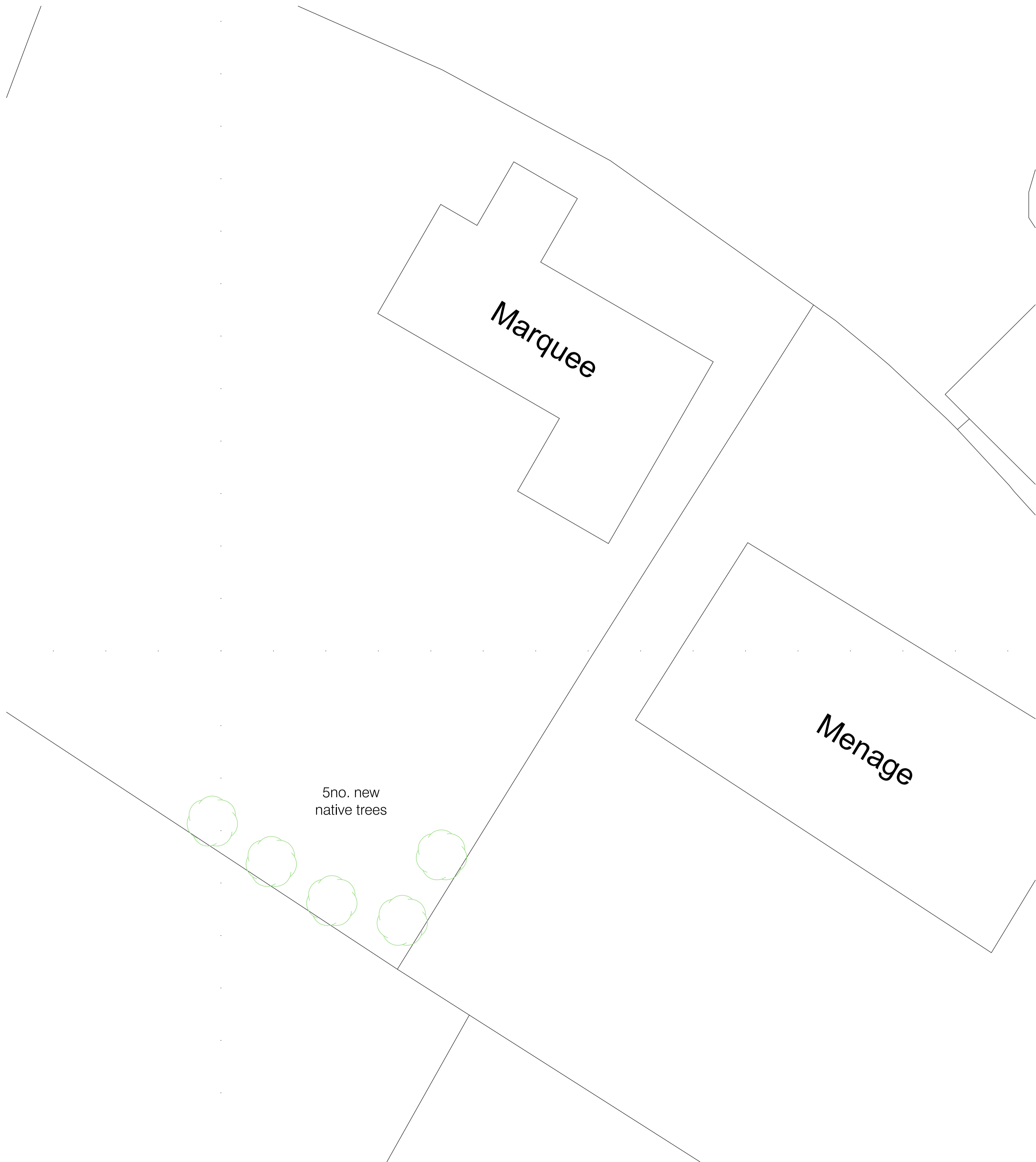
Proposed Site Plan scale 1:200

All dimensions & details given on this drawing are to be checked and verified on site prior to works being undertaken. Any discrepancies and/or variations to the specifications within these drawings or associated documents are to be notified to keystonearchitecture. Do not scale from these drawings - if in doubt - ask. All materials shall be fixed, applied or mixed in accordance with the manufacturers written instructions, recommendations and specifications. Variations to specified materials shall be agreed in writing with keystone architecture. The Contractor shall take into account everything necessary for the proper execution of the works and to the satisfaction of the Local Authority, whether or not indicated on the drawings or in the specification. This drawing is the copyright of keystone architecture and must not be reproduced without written consent. © keystone architecture 2024