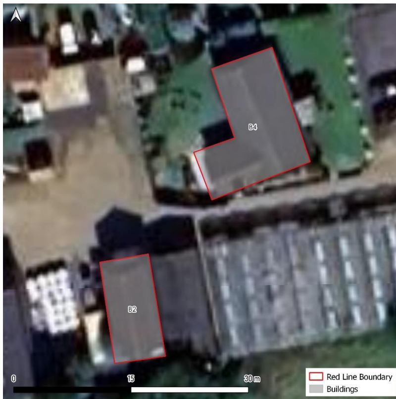
Figure 1 The surveyed building - red line