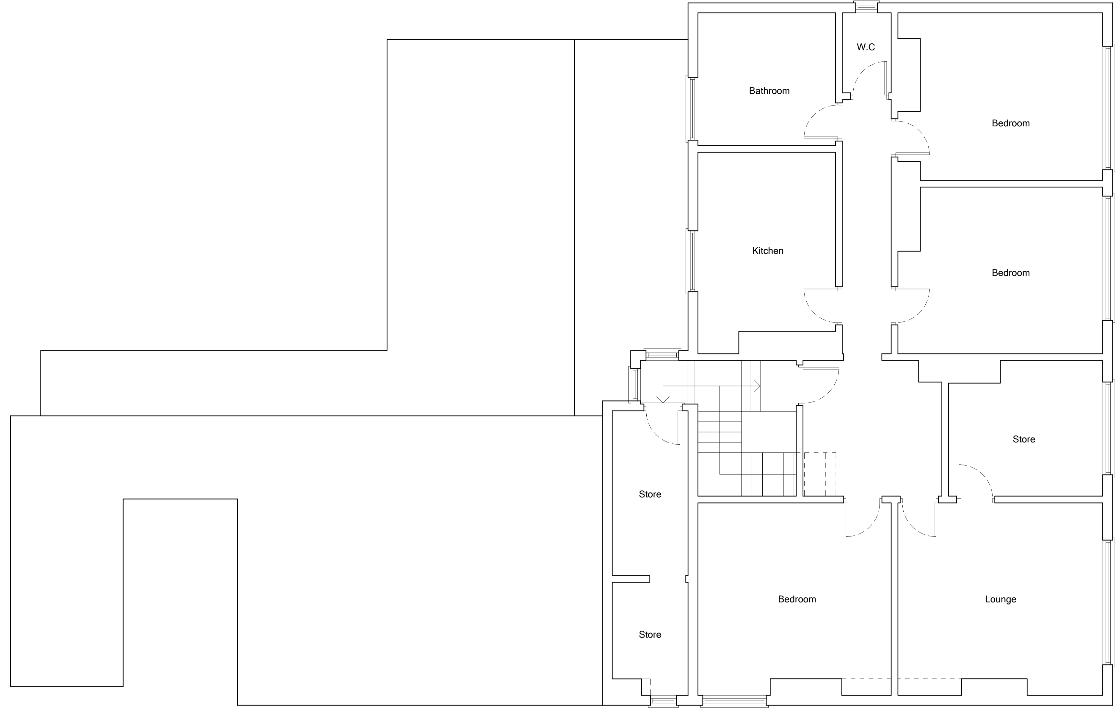
First Floor Plan 1:50