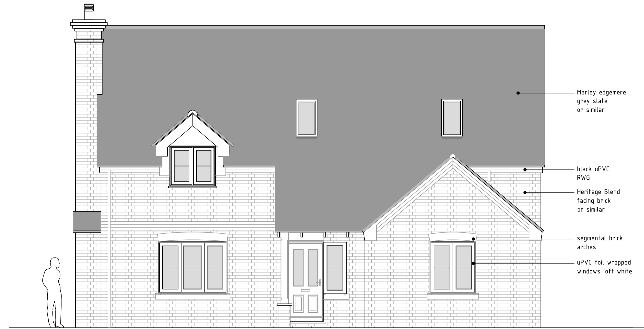
proposed front (south) elevation Scale 1:50