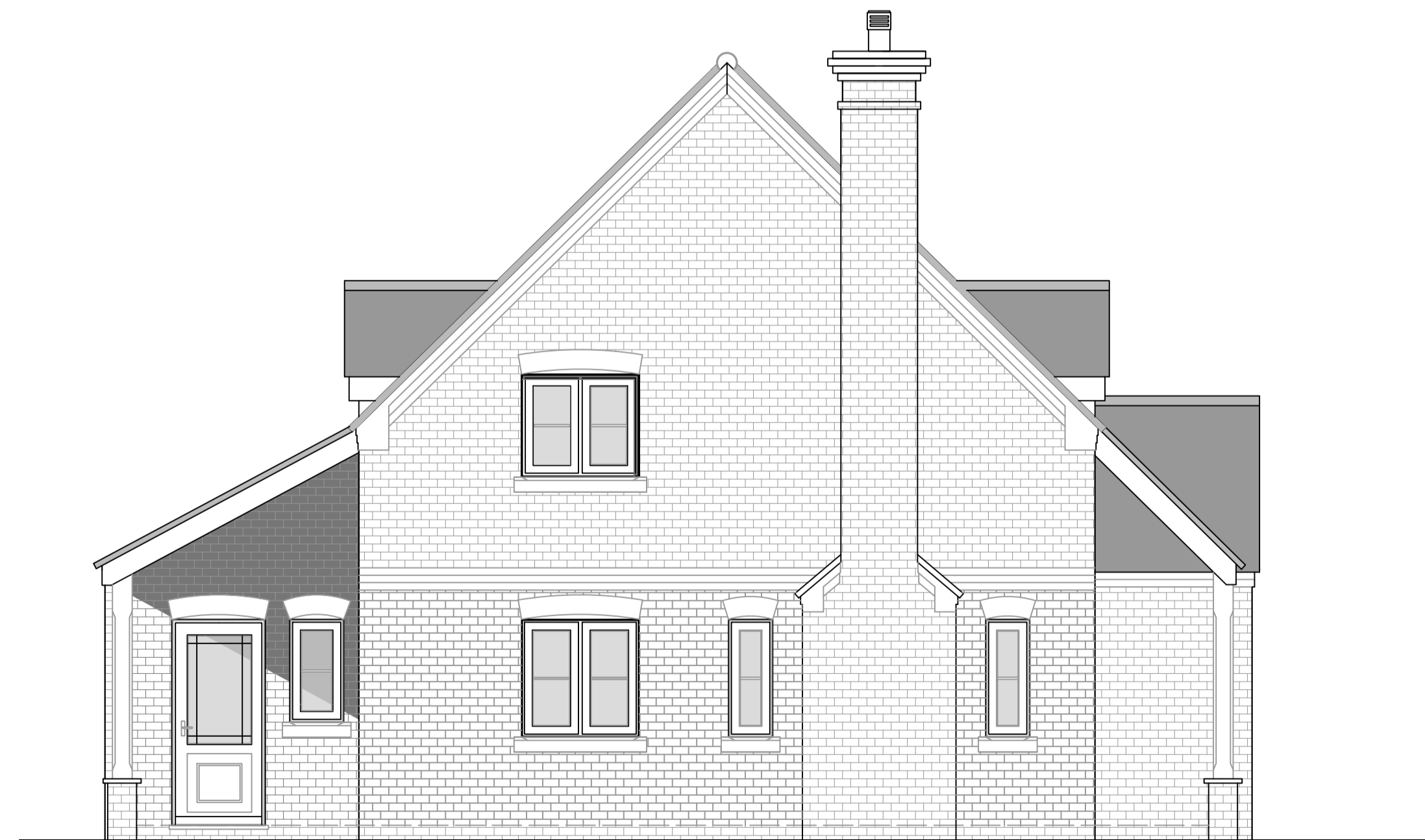
proposed side (west) elevation Scale 1:50