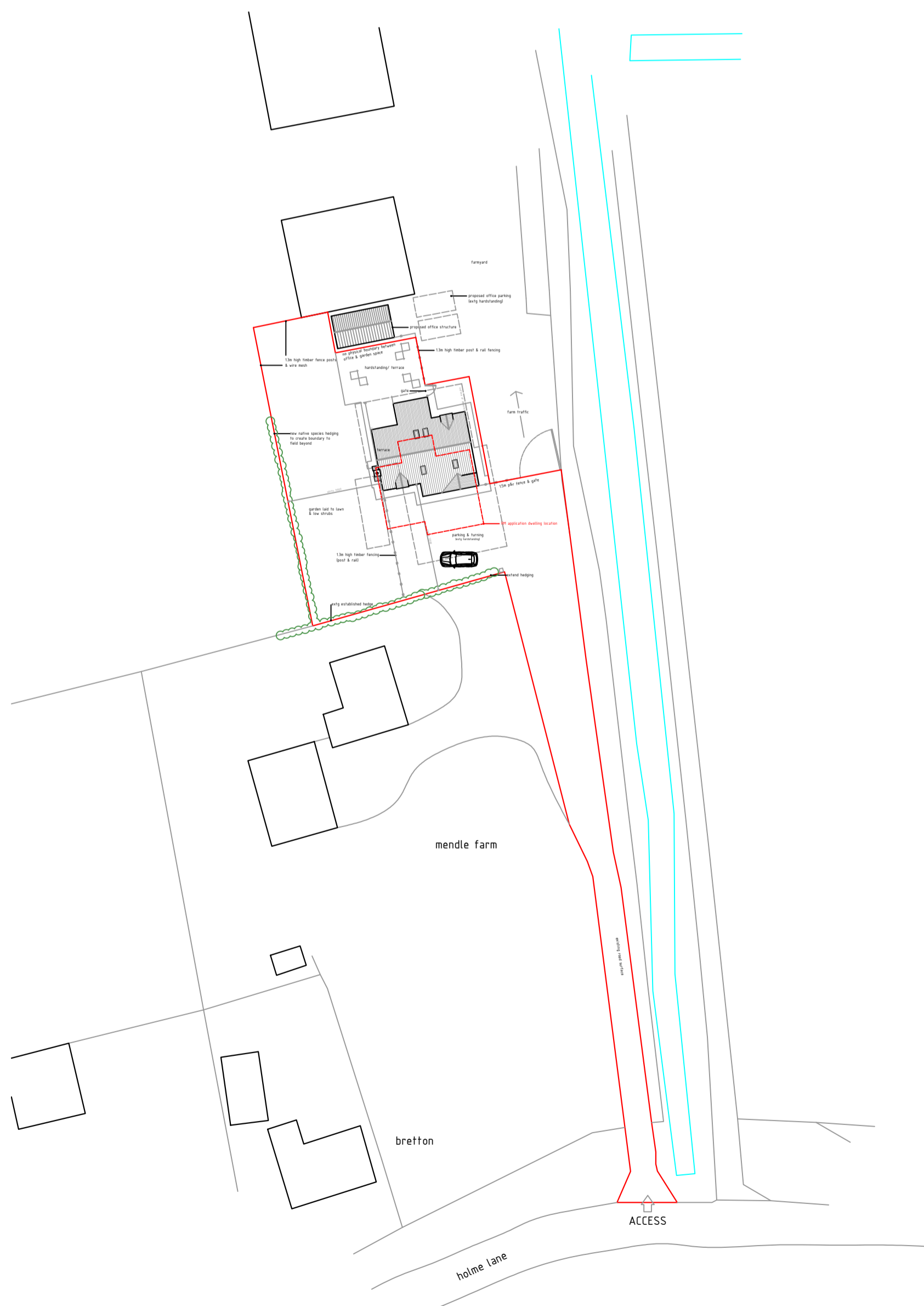
proposed block plan scale 1:500