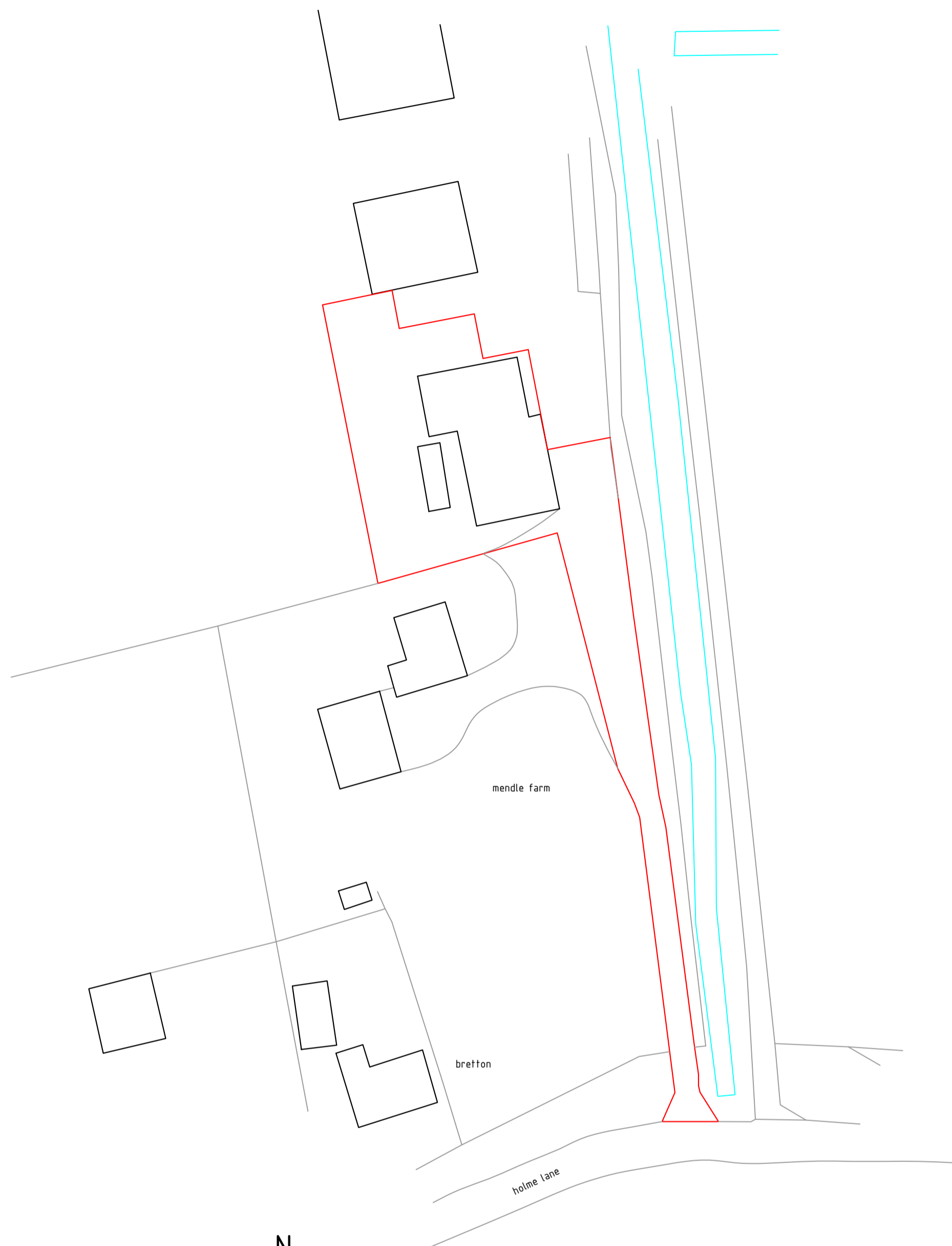
existing block plan scale 1:500

Drwg No: HO/RI/MF/04 rev a Scale: as indicated @ A1 Date: 08/10/2019