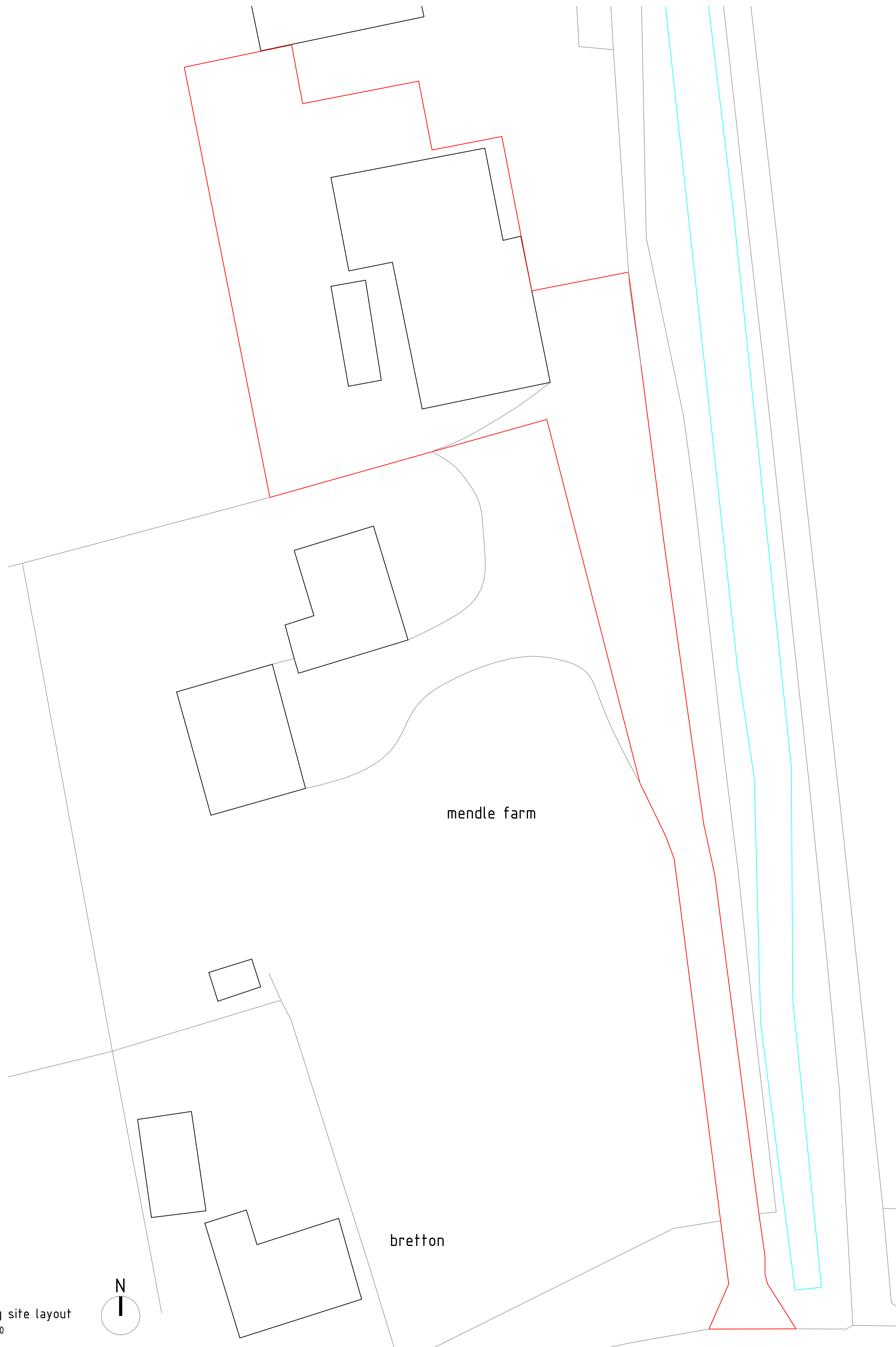
existing site layout scale 1:200