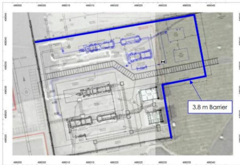
Figure 5-1: Barrier Alignment

A 2 nd consent (PA/2024/1227) was granted 10th February 2025, which varied the previously approved layout. The consented layout is shown below. This permission was granted subject to the same two noise related conditions as approved under the original permission. It is our view these conditions are not necessary (as the revised design differs from the original scheme with significantly lower noise levels) - this is explained in the supporting noise report.