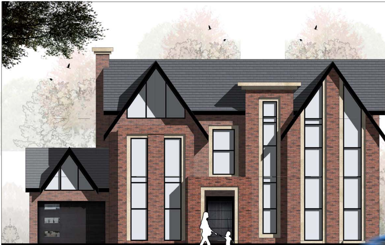
APPROVED PA/2023/56 FRONT ELEVATION

This drawing & design is the copyright of Munshi+Partners and may not be reproduced in any way without prior written consent. Any discrepancies on this drawing between drawings area to be reported to this office. Unless specifically specified these drawings are not to be used for construction purposes or placing of any orders.