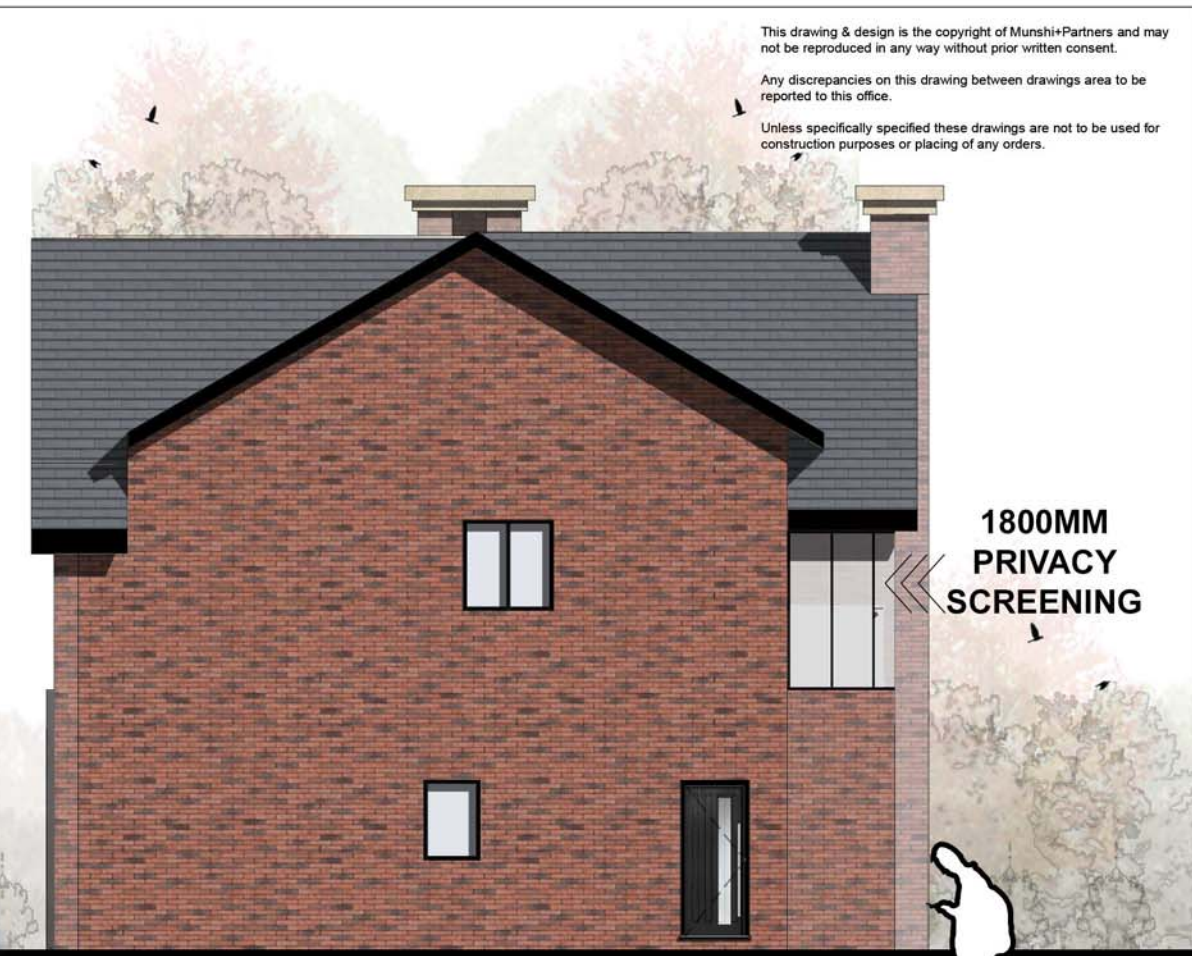
APPROVED PA/2023/56 SIDE ELEVATION