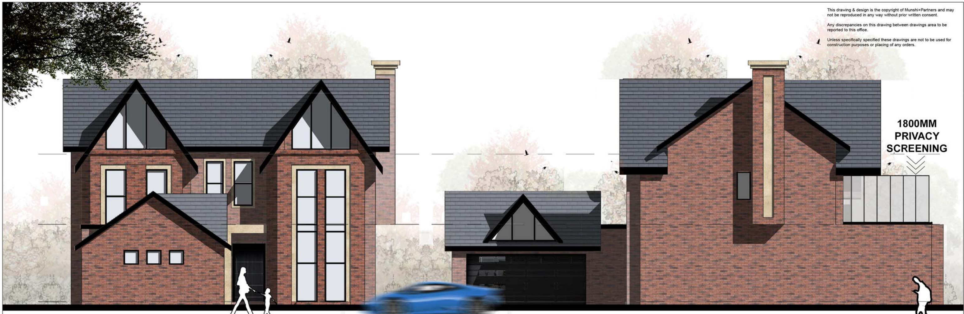
APPROVED PA/2023/56 FRONT ELEVATION

This drawing & design is the copyright of Munshi+Partners and may not be reproduced in any way without prior written consent. Any discrepancies on this drawing between drawings area to be reported to this office. Unless specifically specified these drawings are not to be used for construction purposes or placing of any orders.