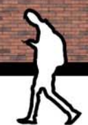
APPROVED PA/2023/56 SIDE ELEVATION