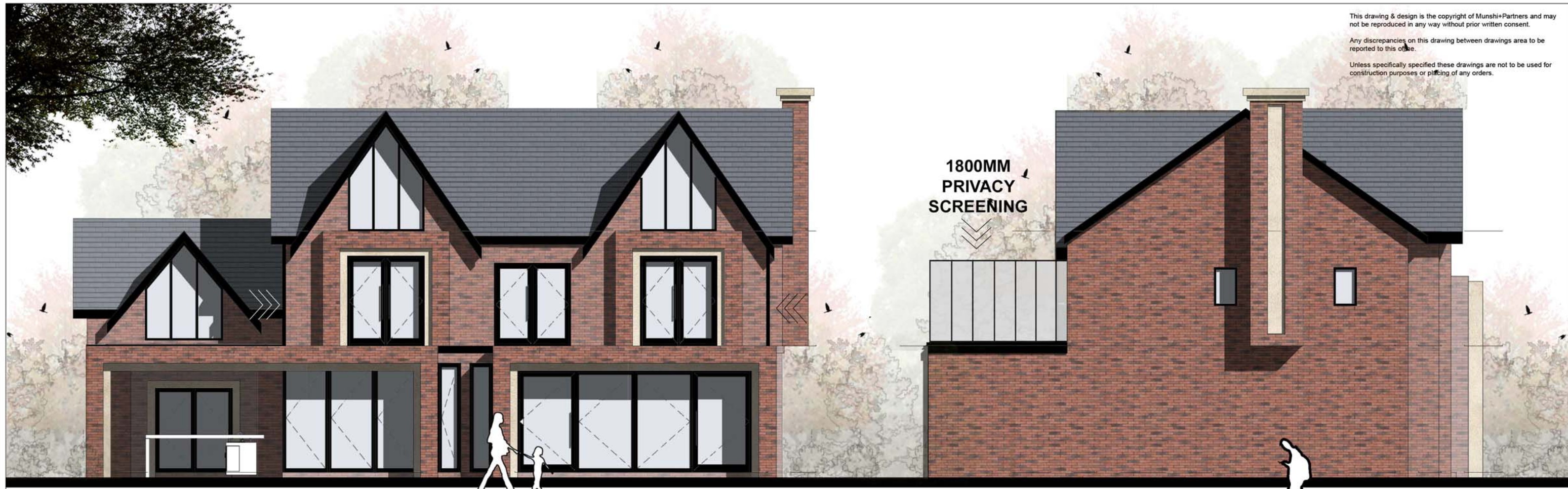
APPROVED PA/2023/56 REAR ELEVATION

This drawing & design is the copyright of Munshi+Partners and may not be reproduced in any way without prior written consent. Any discrepancies on this drawing between drawings area to be reported to this office. Unless specifically specified these drawings are not to be used for construction purposes or pricing of any orders.