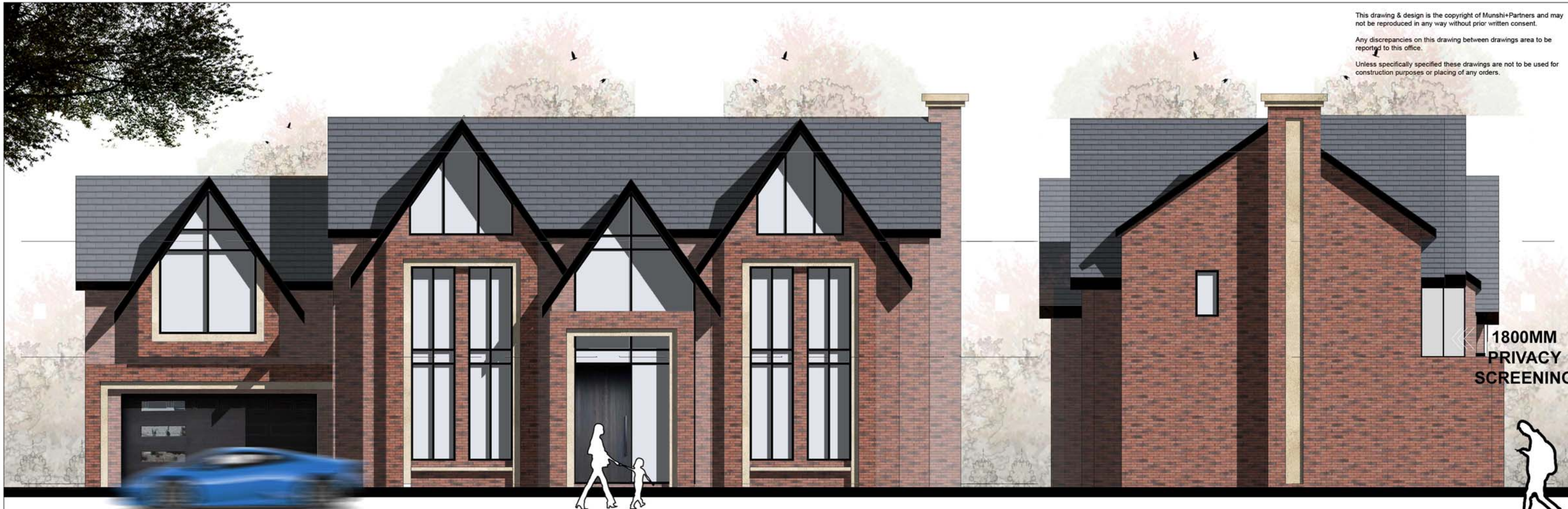
APPROVED PA/2023/56 FRONT ELEVATION

This drawing & design is the copyright of Munshi+Partners and may not be reproduced in any way without prior written consent. Any discrepancies on this drawing between drawings area to be reported to this office. Unless specifically specified these drawings are not to be used for construction purposes or placing of any orders.