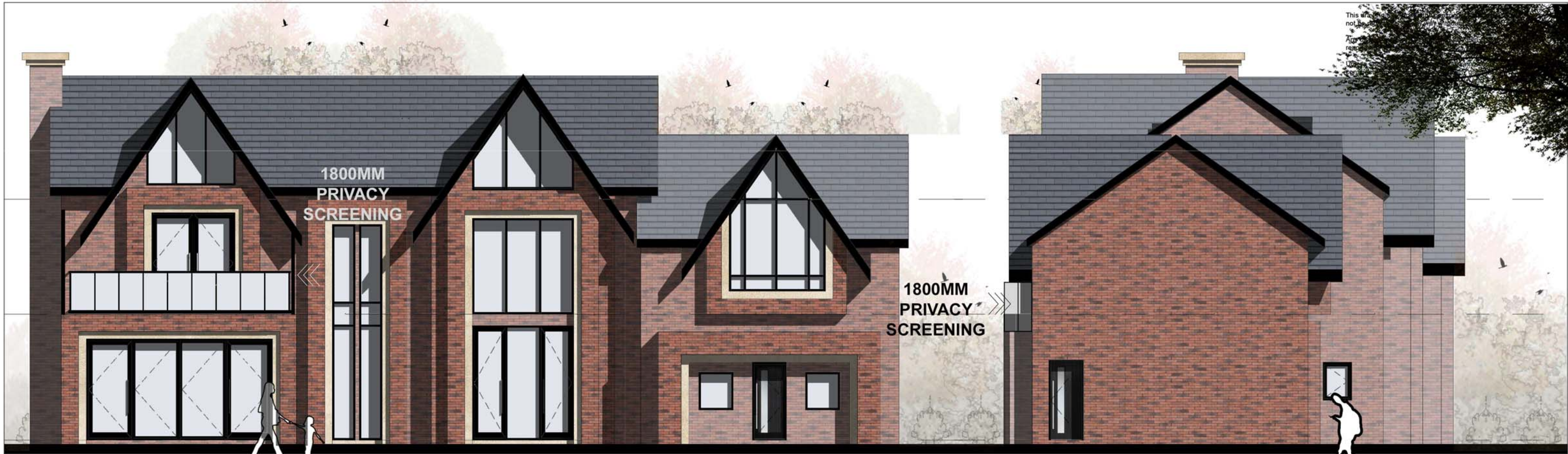
APPROVED PA/2023/56 REAR ELEVATION