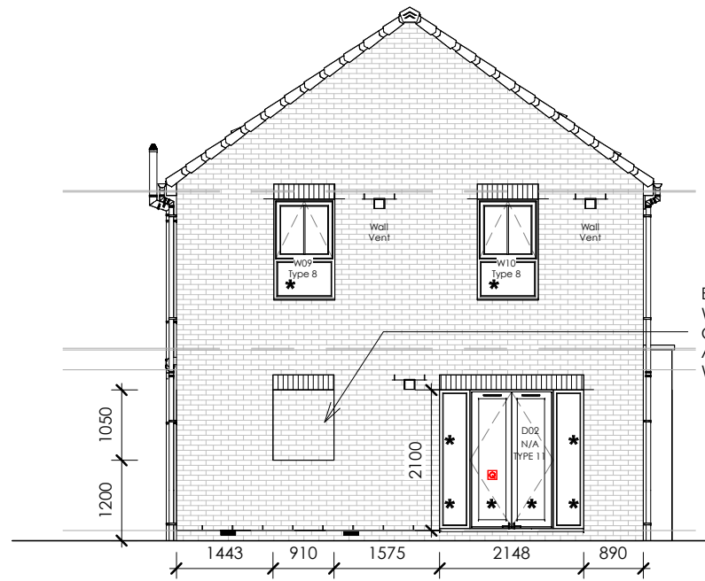
WELCOME CENTRE ELEVATION B

POWER REQUIRED FOR ILLUMIANTED STRATA SIGNAGE. SIGN SHOWN INDICATIVELY. WBP BLACK PLY FRONTAGE. BLACK TIMBER PANEL INFILL TO RECEIVE SIGNAGE BY MARKETING. FULL HEIGHT GLAZING TO BE INSTALLED. ALLOW TO REMOVE AND INSTALL DOOR AS PER STD HOUSE TYPE.