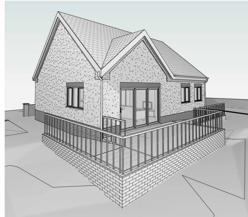
Rear Perspective 2