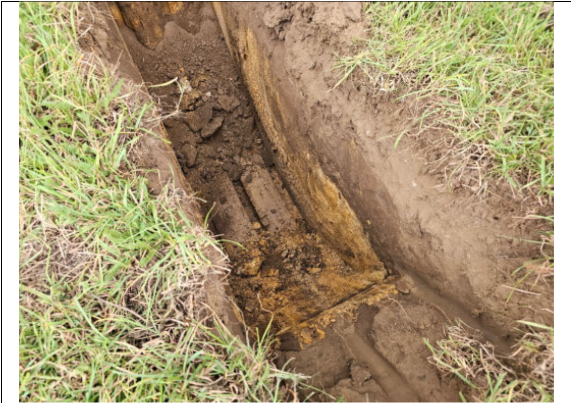
Trial Pit TP1 - After excavations