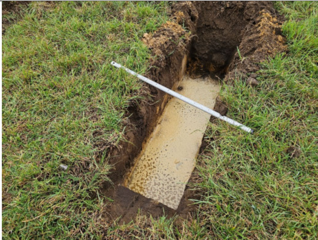
Trial Pit TP1 - During testing