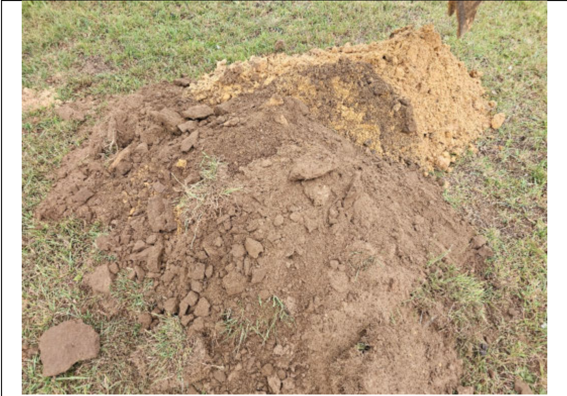
Trial pit TP2 - Excavated spoil