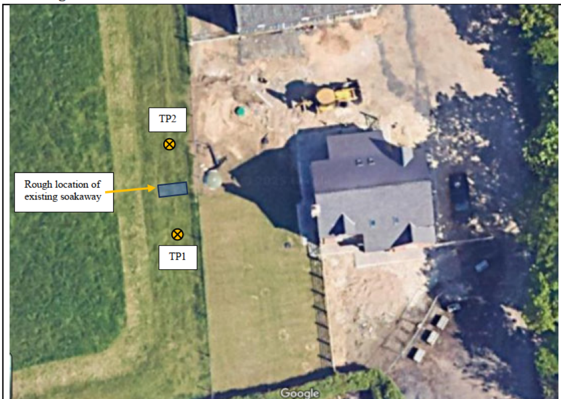
Figure 1: Soakaway test locations and rough locations of existing soakaway

Further to your instruction Humberside Materials Laboratory (HML) were engaged to undertake a site investigation on land at Mendle Farm, Holme, Scunthorpe. The site investigation included two trial pits (TP1 & TP2) to assess the sites potential capacity for underground drainage via soakaway testing. The test locations were selected by the onsite HML engineer with a site brief to test near existing soakaway, a location plan showing test locations and rough location of existing soakaway is included below within figure 1.