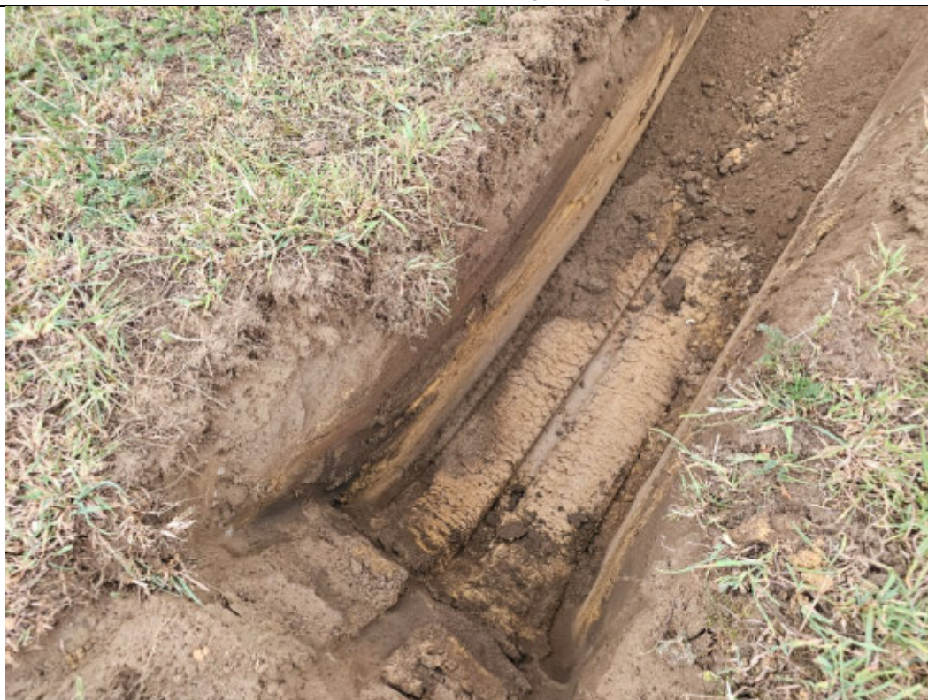
Trial Pit TP2 - After excavations