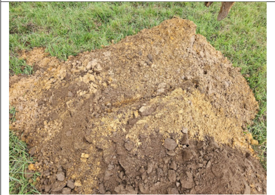
Trial pit TP1 - Excavated spoil