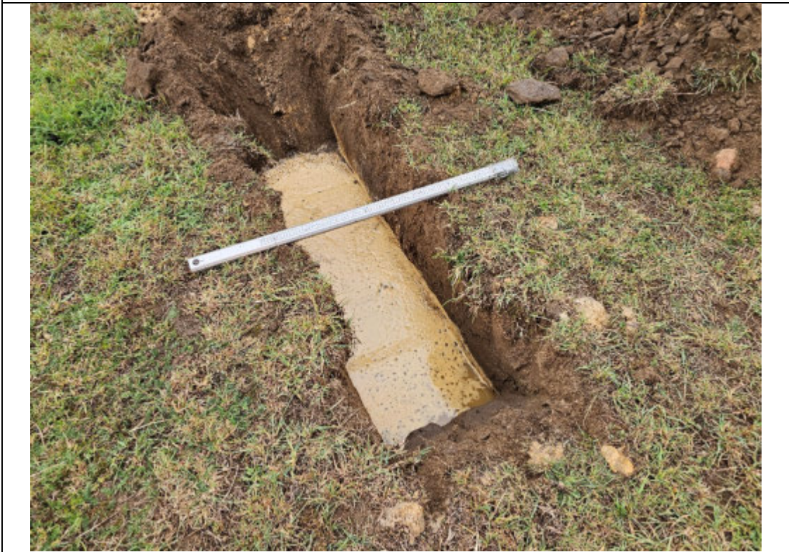
Trial Pit TP107 - During testing