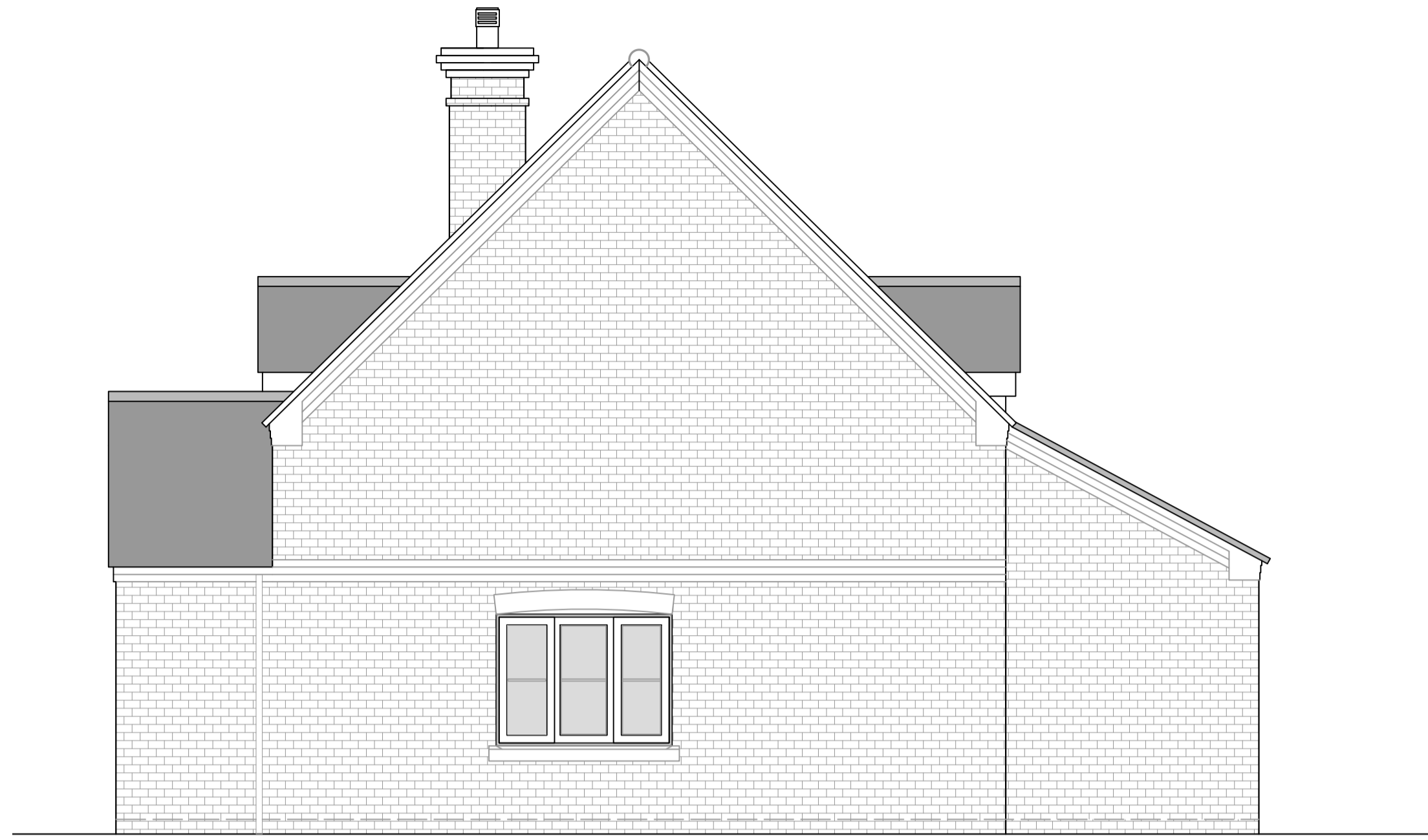
proposed side (east) elevation Scale 1:50