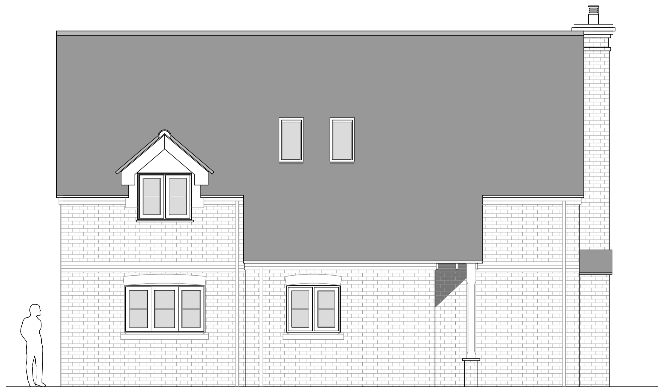
proposed rear (north) elevation Scale 1:50