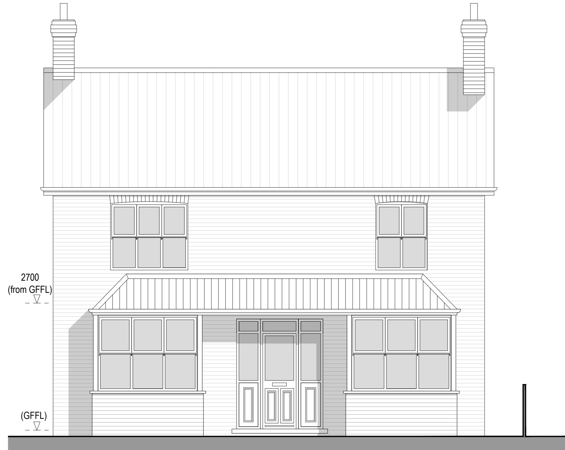
SOUTH EAST ELEVATION | PROPOSED 1:50 @ A2