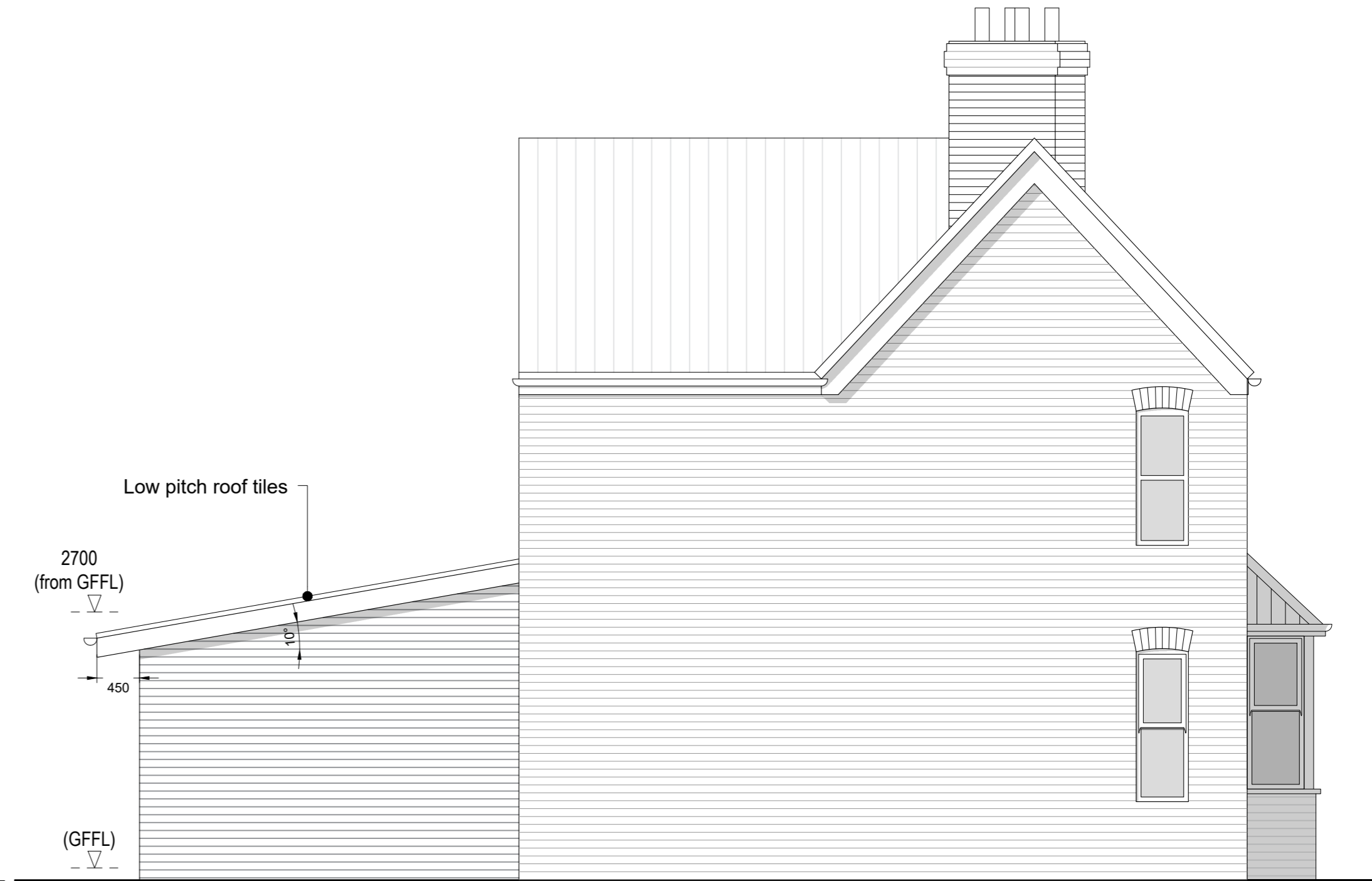
SOUTH WEST ELEVATION | PROPOSED 1:50 @ A2