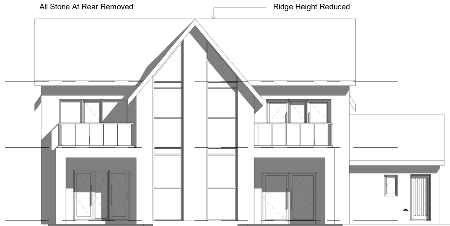
1 Rear - Proposed 1 : 100