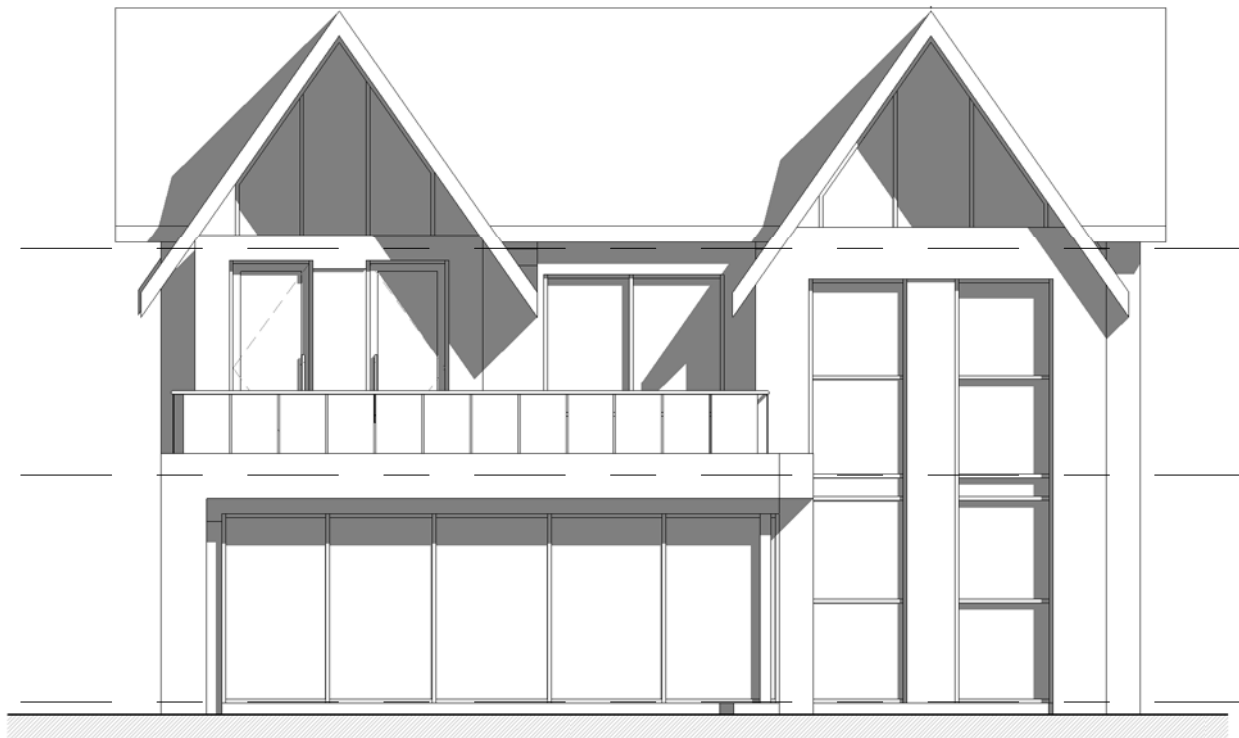
1 Rear - Proposed 1 : 100