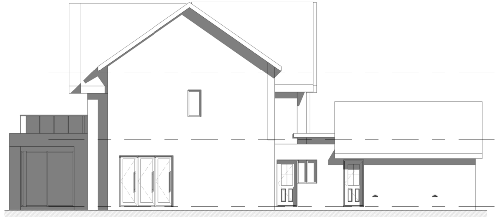
2 Right Side - Proposed 1 : 100