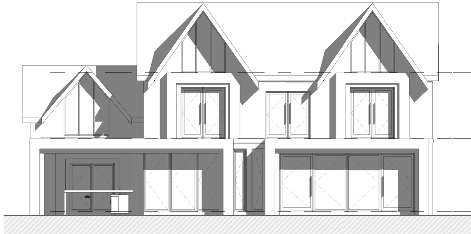
1 Rear - Proposed 1 : 100

Unless specifically specified these drawings are not to be used for construction purposes or placing of any orders.