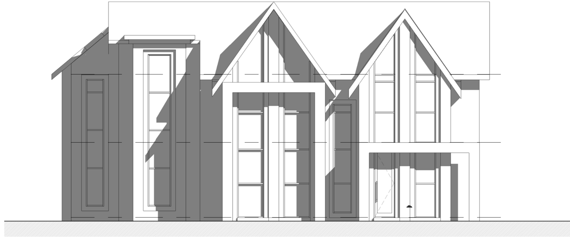
1 Rear- Proposed 1 : 100