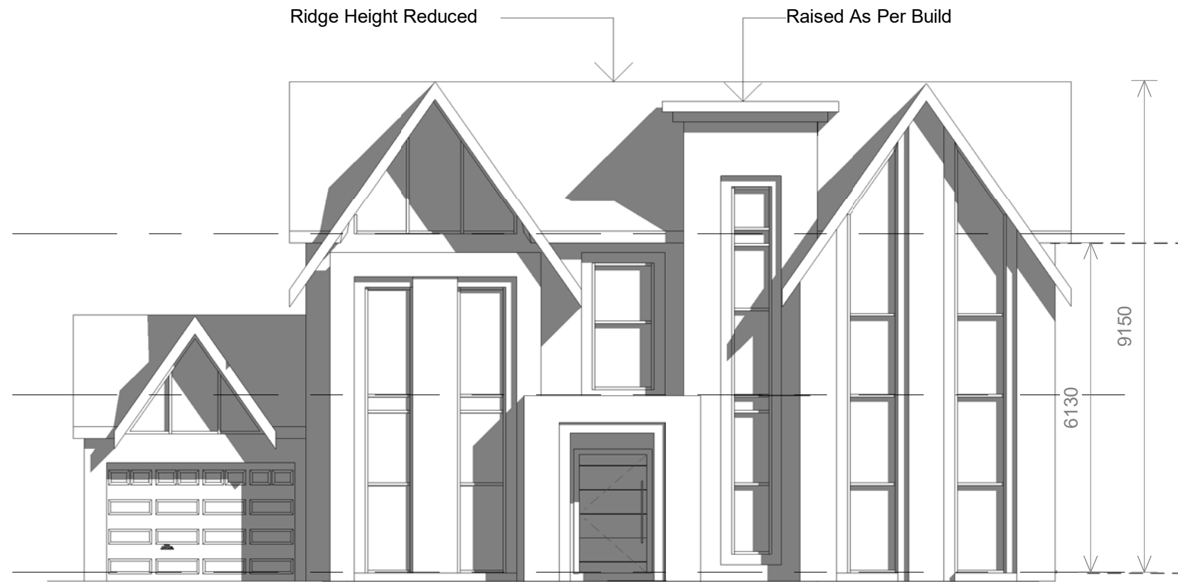
1 Front - Proposed 1 : 100